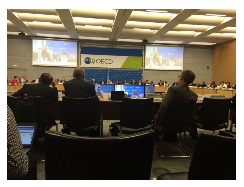
Figure 2: International conference

In this section, we draw on practices that involve presentations and discussions at international meetings we observed (Figure 2). These include, for example, task forces of Eurostat and various meetings of population and housing experts at the UNECE and Conference of European Statisticians. Presentations invariably included a series of repetitions that were not defended as much as put forward as something that everybody knows. We identify four repetitions: defining what Big Data is, how it is better than traditional sources, and what skills it demands; demonstrating how Big Data can or cannot deliver official statistics; differentiating the data scientist from the figure of the iStatistician; and defending the authority of NSIs to establish, and evaluate adherence to, the legitimate criteria for the production official statistics.