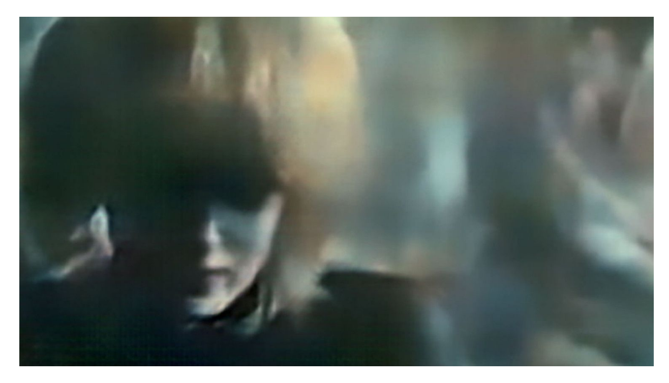
Figure 6. A screenshot from the updated version of 'Blade Runner—Autoencoded' that was trained an additional 20 times on the film.

This work was also both exhibited in, and screened as part of the accompanying film program for the exhibition 'Dreamlands: Immersive Cinema and Art, 1905–2016' at The Whitney Museum of American Art in New York. The exhibition brought together the work of artists that articulate the shifts that have taken place as technology has altered the way in which space and image are constructed and experienced. The exhibition engages with the fact that we are living in an environment more radically transformed by technology than at any other point in human history, and where cyberspace determines the contours of everything. [B] ( maybe change this last sentence )