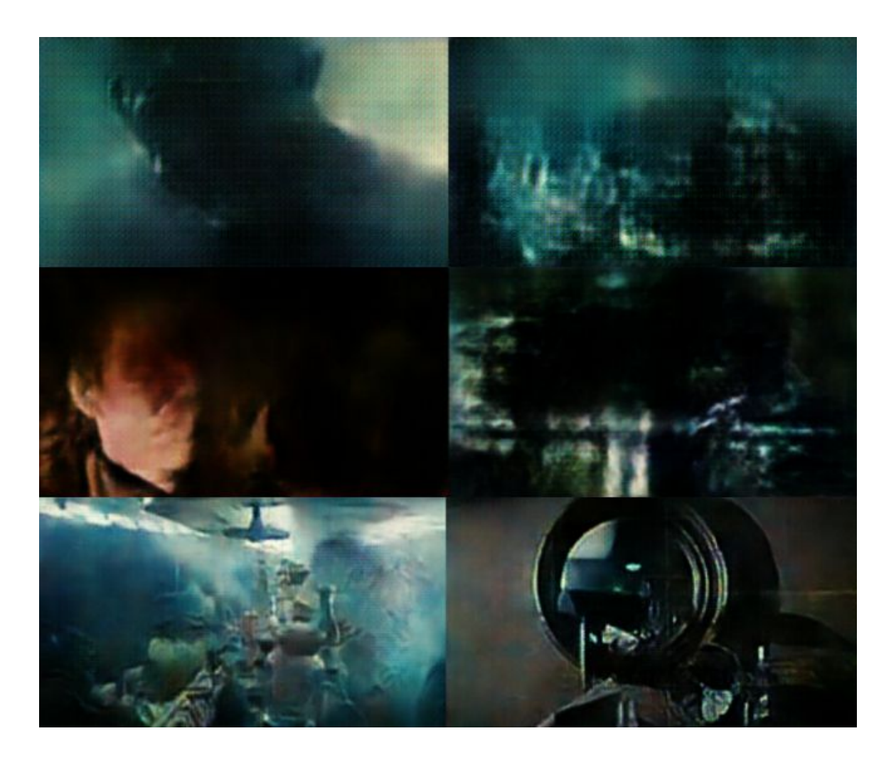
Figure 2. Samples after training the model on frames from Blade Runner for 1 epoch (top row), 3 epochs (middle row) and 6 epochs (bottom row) at a resolution of 256x144.

improvement made to this training procedure as part of this project was to reduce the amount of noise injected into the latent space over the course of training (by reducing the standard deviation of the Gaussian prior), in order for the model to better differentiate between frames that were similar (a more detailed, technical account of this training procedure can be found in the original technical report [13]).