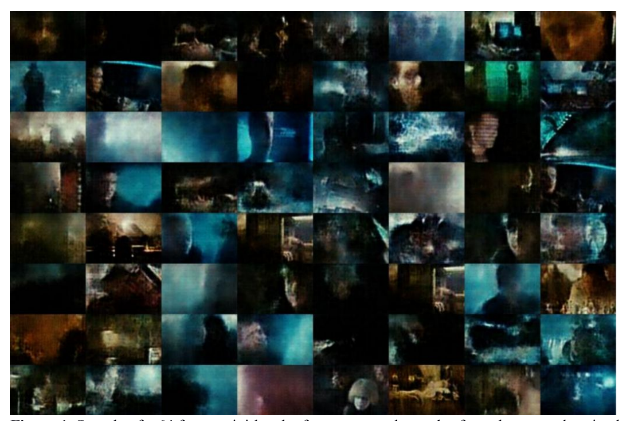
Figure 1. Sample of a 64 frame mini-batch of reconstructed samples from the network trained on Blade Runner after 1 epoch at a resolution of 96x64.

Initially the model was only trained at a resolution of 96x64 (64x64 was the standard in research at the time). The size of the model was increased to be able to create a video that was watchable online, with the largest possible model that could be represented on a single GPU being 256x144 (coincidentally the smallest resolution allowed on YouTube). By increasing the size of the model, training was made a lot slower and more precarious, making it more likely that one of the three networks (that all have to learn in unison) would fail, resulting in a sharp degradation in the quality of images. Forcing the process to be started again from the beginning. It took approximately 3 days for the model to be trained on all the frames from the film once. (One complete cycle through the dataset is referred to as one epoch.)