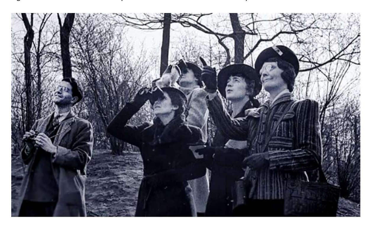
Figure 1: National Audubon Society's Annual Christmas Bird Count in early 1900s