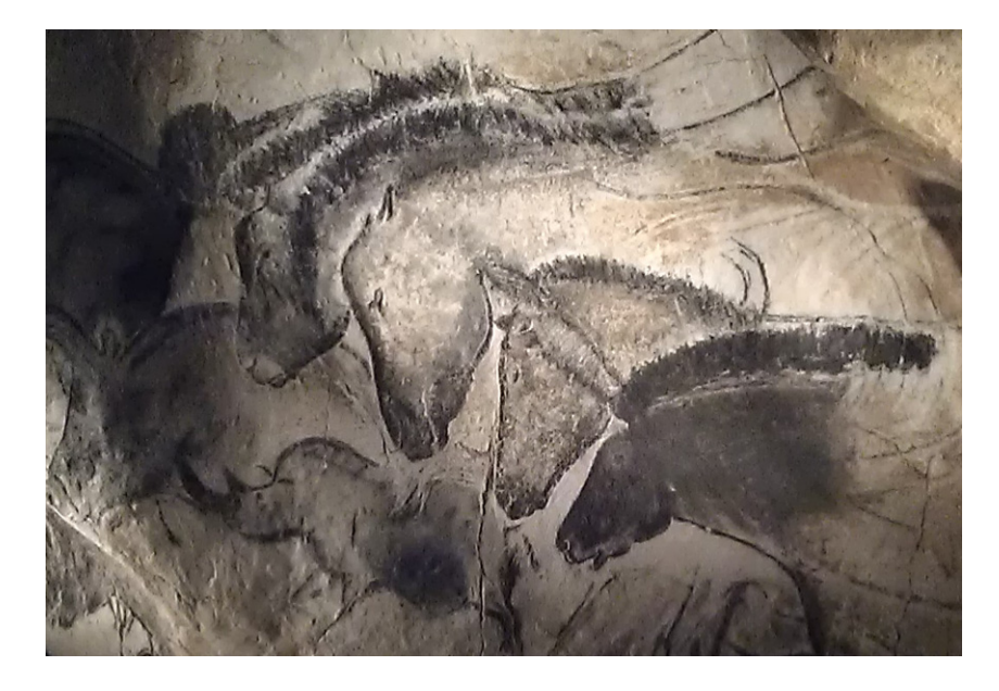
Figure 2. Group of Chauvet Cave Drawings. By Nachosan - Own work, CC BY-SA 3.0, https://commons.wikimedia.org/w/index.php?curid=32316562.

In this context—and we rush here to our conclusion, and by way of returning to our central theme—the status of the graphic arts is given a powerful boost by the fact that so distinct is the emergence, and so invariant over time the performance and reception of certain of its styles, that we are entitled to regard it as a phenomenon —a phenomenon as yet imperfectly understood, but no less worthy of study, and potentially no less rewarding, than the phenomenon of a certain mineral ore able to fog unexposed photographic plates. Or in other words, we have here a near-ideal venue for interaction between the humanities and the sciences in respect to the question of a humane machine intelligence; and in support of this claim we exhibit following a group of drawings from the Chauvet Cave created some 32,000 years ago (Figure 2)—and the freshness and clarity and sensitivity of which must instill in us a deep wonder: