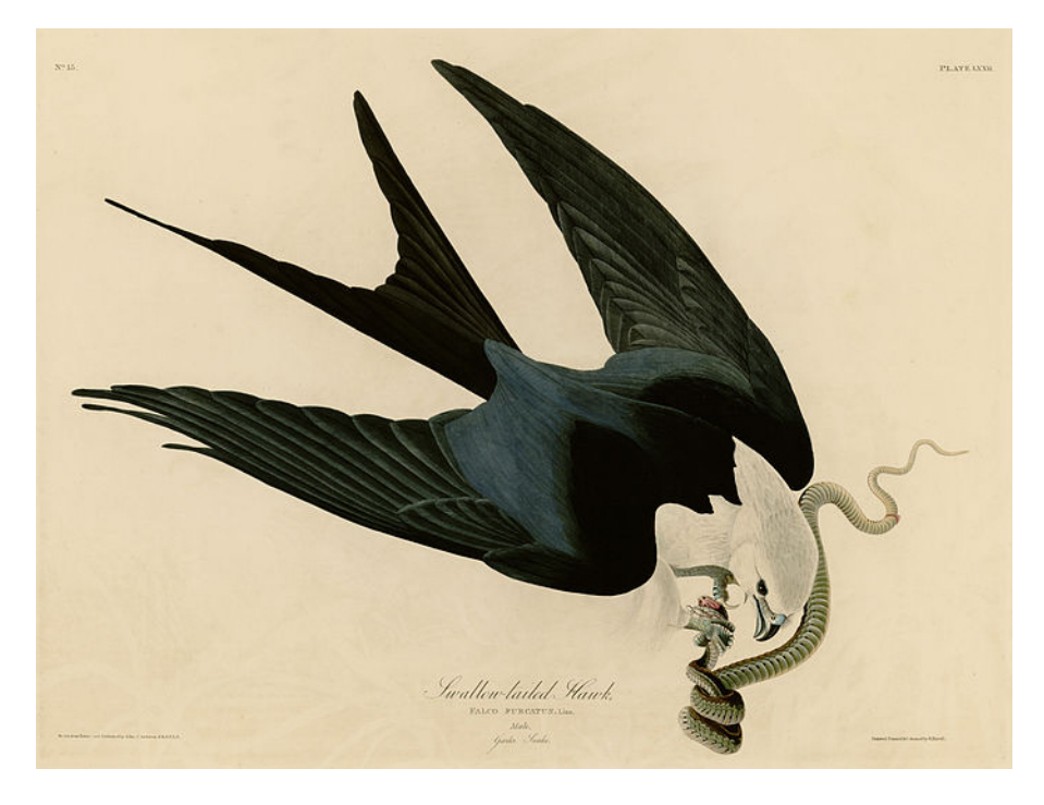
Figure 3. Swallow-tailed Kite by John James Audubon.

A computational analysis of the exquisite lines thereof (refined, as we must note, by the master engraver Havell) would almost certainly reveal, from a human factors standpoint, some noteworthy, if not indeed uncanny, qualities; but what should strike us as most uncanny is the fact that the collected set of such images—the graphic art created by Audubon under humble circumstances as he trekked through the wilds of North America—has been responsible for an outpouring of public commitment to environmental preservation to which no modern public relations campaign can bear comparison; i.e., we have here an example of the fact that art has a very real and unique power, and a greater appreciation and understanding of which has now become a vital matter.