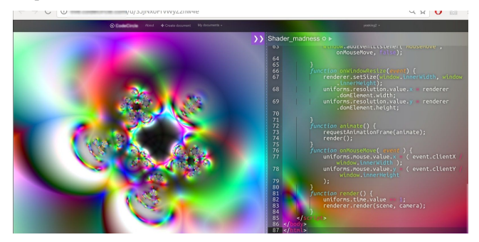
Figure 2. Screenshot of the codecircle platform, showing the program running on the left and the code being edited on the right

More information about Codecircle, including a comparison to other browser programming environments, is provided in [8]. Details of how we are using Codecircle for teaching and research are provided in [9].