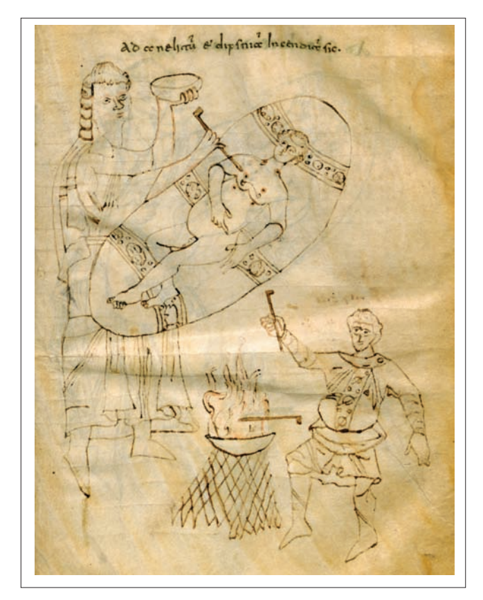
Figure 19.1 Cautery depicted in a 9th-century Latin manuscript, Plut. 73.41, f. 122 r.

Even though the surviving evidence is, as yet, too slim to make any substantial claims about links in the global medieval world of medicine, such performative images, of which we will hear much more in this chapter, provide intriguing testimony on the basis of which to ask more informed research questions of the period, and imagine new pathways to a history of 'travelling medicine'. They focus us on the following domains for close analysis: the widespread use of cautery and body piercing techniques, the sparse efficient detail of the images, the direct text-image relationship, and the ambiguous relationship with authoritative texts.