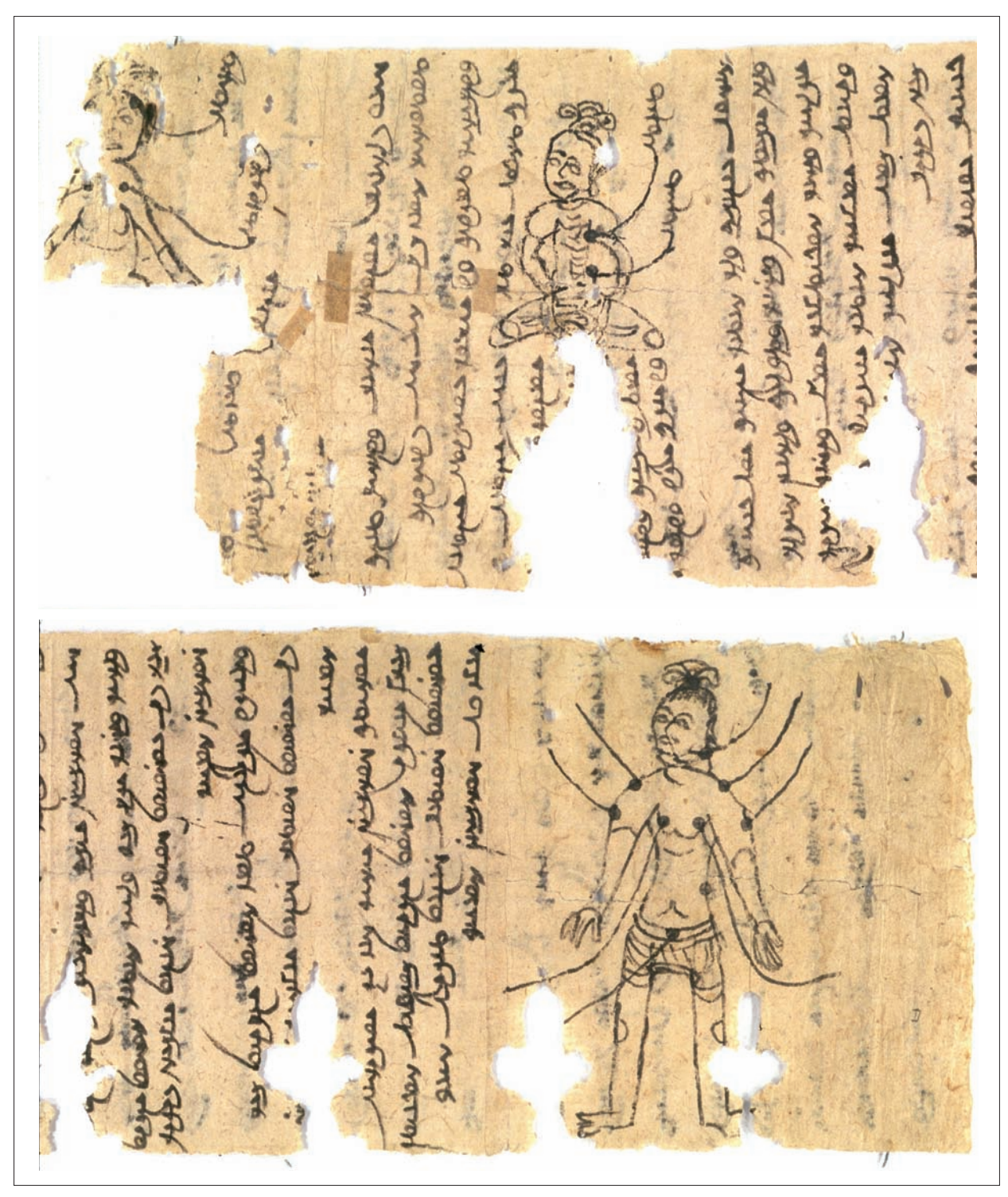
Figure 19.6 A Uighur moxa-cautery chart with remedies. Mainz 0725, p. 2.