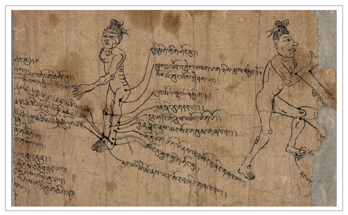
Figure 19.3 Tibetan moxa-cautery chart from Dunhuang. Image 1 (on our left) marks 13 locations on the lower limbs. To the left-hand side of the text, along with descriptions of three points indicated, there are 12 broken lines of text, apparently relating to another image, now no longer extant. Image 2 has six points marked but the text is damaged. © Bibliothèque Nationale, Paris, Oriental ms. Pt.1058

the wind giving the impression of movement. The figures' eyes are intent with dark pupils focussed somewhere in the distance. In contrast to the posed and diagramatic figures of the Chinese moxa-cautery charts we will meet later on, the Tibetan ones are rather individual characters: one with eyelids and lashes lowered; the other with eyes wide open, staring straight ahead (Fig. 3).