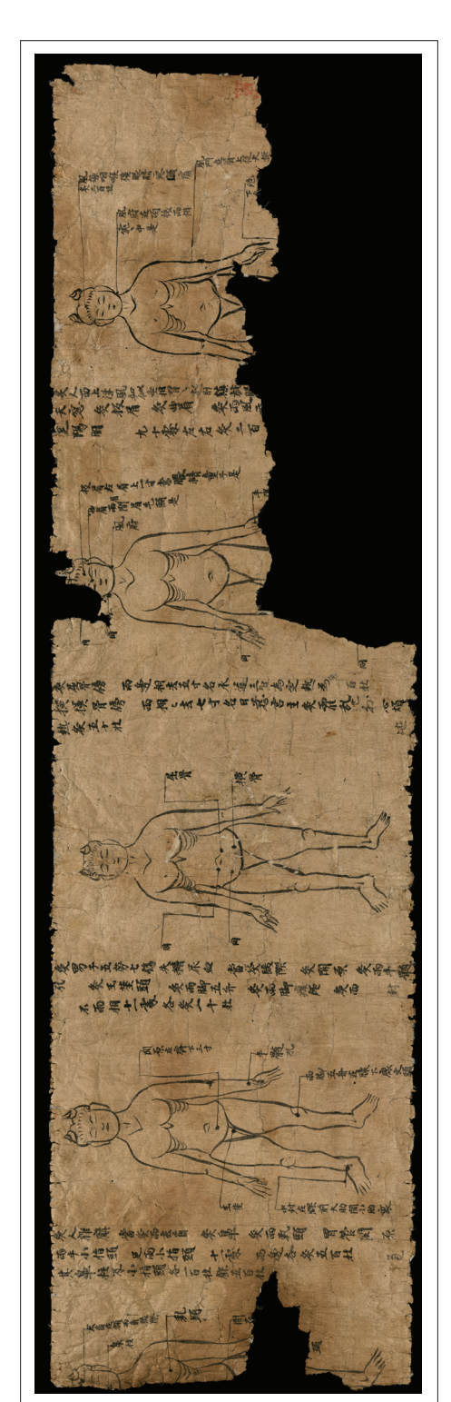
Figure 19.4a Chinese moxa-cautery chart from Dunhuang, Or.8210/ S.6168. Above: right-hand side; below left-hand side.