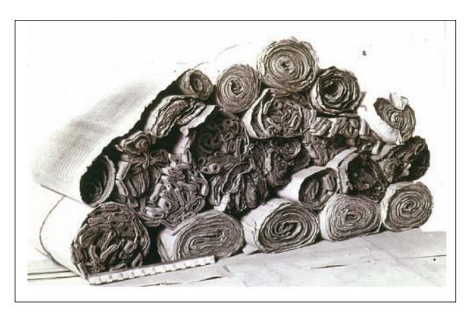
Figure 19.2 A pile of scrolls, after removal by Stein from Cave 17 in Dunhuang.

the Chinese medical manuscripts from Dunhuang reveal exotic influences and exchanges, hitherto unknown in the Chinese medical literature that has been passed down to us in printed form, and edited countless times since the imperial patronage of medical publication in the Song period (960-1279).