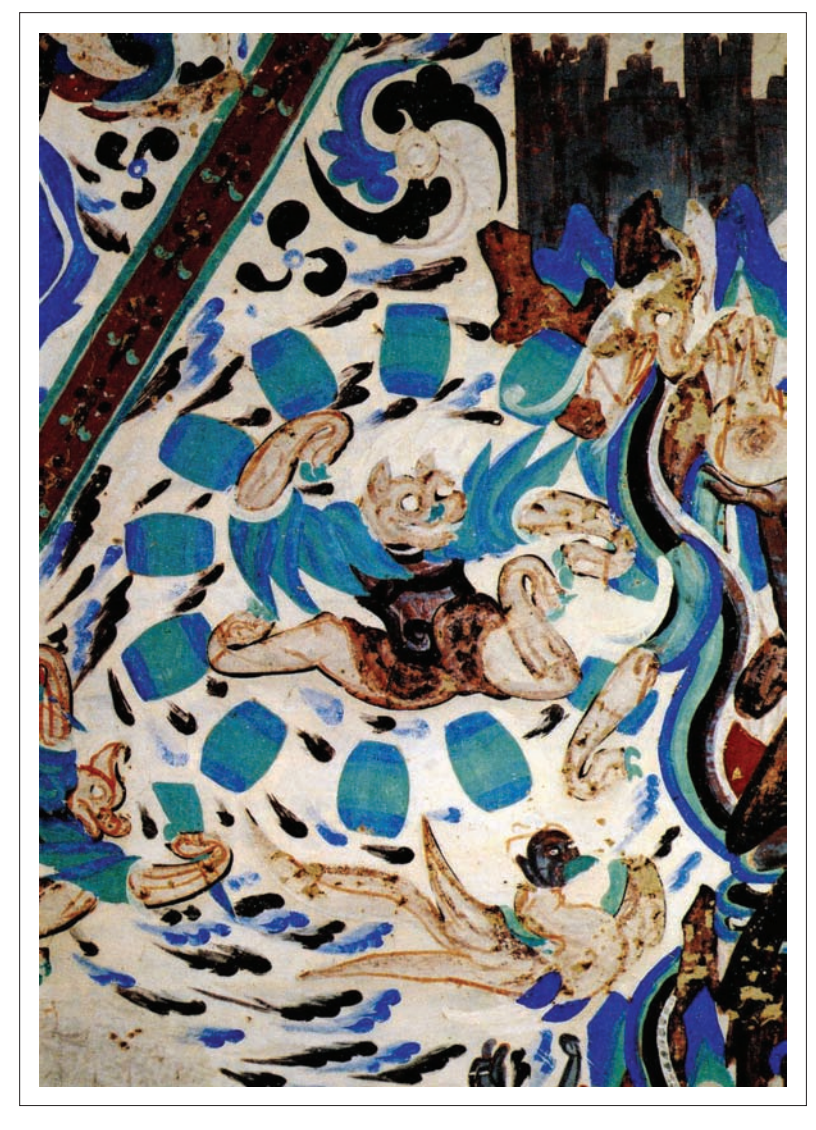
Figure 19.5a and b A ceiling mural from Western Wei 534 –556 Cave 249 at Dunhuang shows Lei Gong 雷 公, the Thunder Duke or the Thunder Spirit, surrounded by drums, together with another image (below right) that some suggest is the Feng Shen 風神 (Wind Spirit), or Feng Bo 風伯 (Wind Uncle) with a bag full of wind on his back.