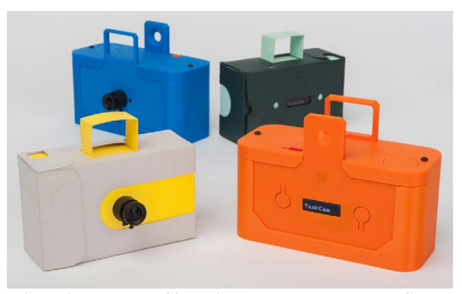
Figure 1: Examples of 3D-printed and paper-clad TaskCams.

At the same time, through their design as well as instructions, videos, and advice on an associated website (www.probetools.net), TaskCams serve as a new means for disseminating a design-led methodology for understanding users and their settings. They are the first in a planned