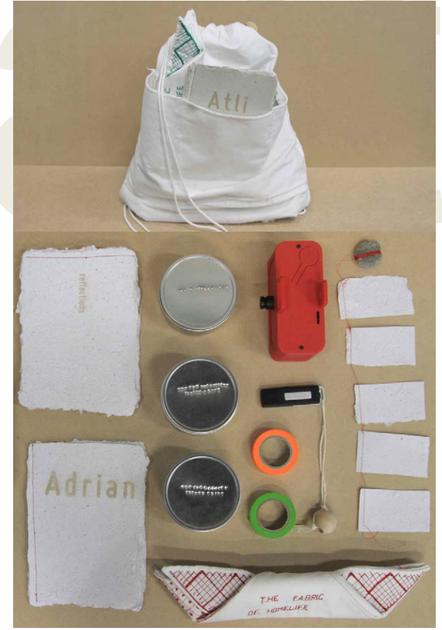
Figure 6. The cultural probes bag and a view of the probe activity contents crafted for our minimalist participant.

Soundscapes, stories & secrets We included an audio recorder in the bag with several prompts inviting our participants to capture soundscapes and stories of their everyday life with us. The audio recorder was also used in combination with other probe tasks, such as Imagining In