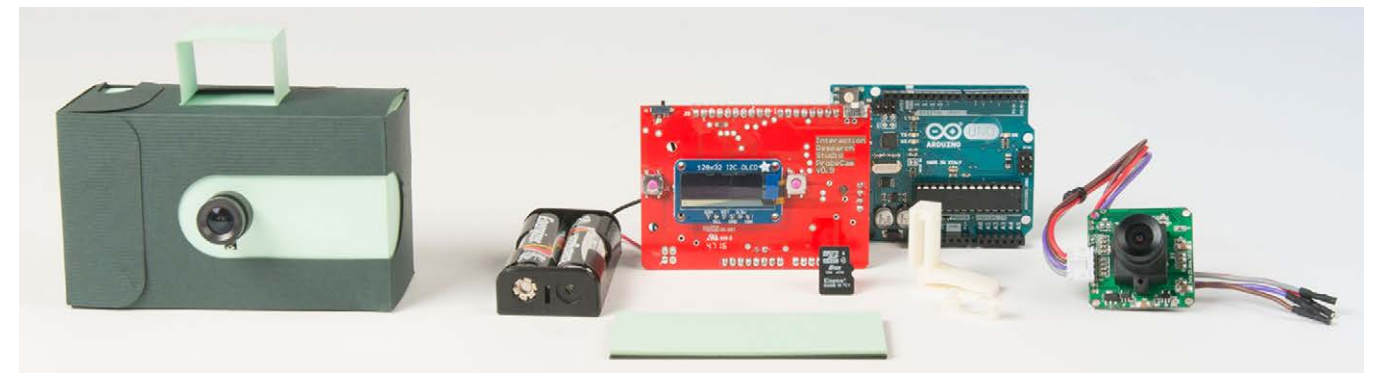
Figure 3. Paper TaskCam with hardware components. From left to right: battery holder, custom shield with SD card in front, Arduino Uno, and Linksprite JPEG Camera.

Most TaskCams are built using an Arduino Uno microprocessing platform [1] linked to a Linksprite JPEG Camera [25] via an Arduino 'shield', designed and produced by the Interaction Research Studio, that plugs directly into the Arduino's existing IO pin headers (Figure 3). The shield incorporates the text display, a Micro SD card reader, and the camera trigger, and allows the camera