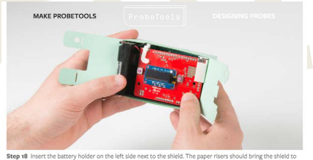
Step 18 insert the battery holder on the left side next to the shield. The paper risers should bring the shield to the same hight as the battery holder. Adjust adding or removing paper risers until the fit is shug.

There are several things worth noting in reading the