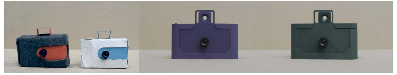
Figure 9. Variations on TaskCams: the wool and home-made paper enclosures and the aerosol painted 3D prints.