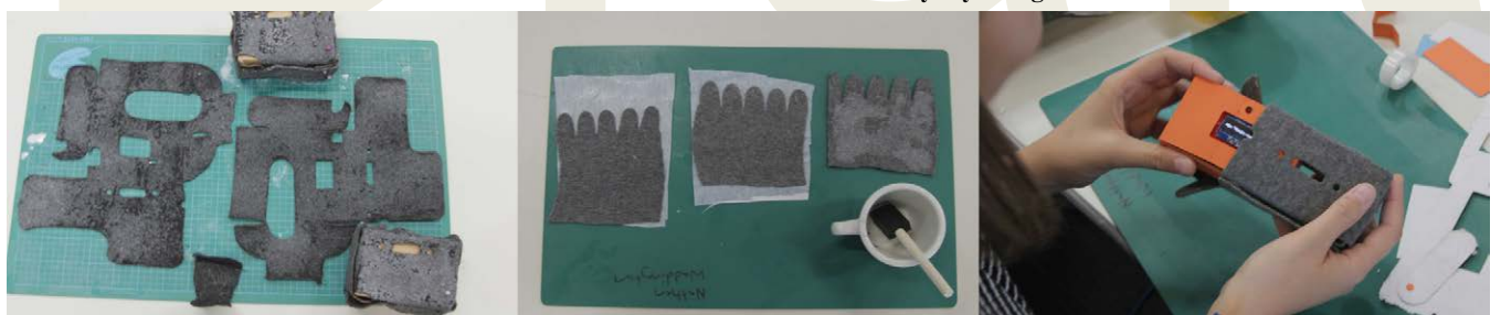
Figure 8. Our experiments with the soft enclosure included iteratively resizing the original lasercut file, stiffening the fabric using interfacing and applying fabric stiffener on the flat (pre-lasercut) and assembled (post-lasercut) enclosure.