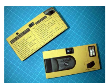
Figure 2: Disposable camera relabelled with requests for images – the model for the TaskCams.

mobile computing might seem to compensate for this by allowing the design of probes based upon new devices, and indeed other researchers (e.g. [14,16]) have based probe studies on smart phones and similar devices. There are several drawbacks with using commercial devices for probes, however, Perhaps most importantly, probe