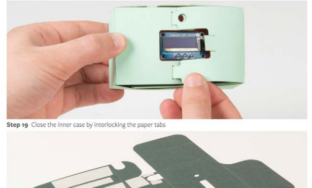
Figure 5. Partial screenshot of instructions for making Paper TaskCam.