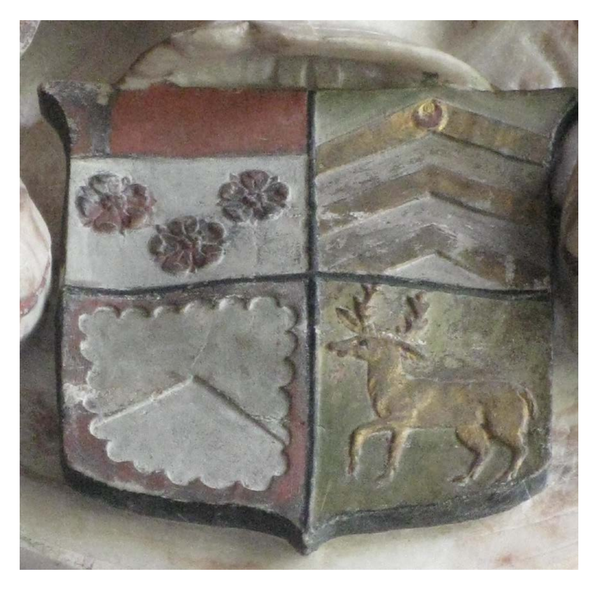
Figure 4. Funeral monument of John Sparrow senior (detail), at Gestingthorpe, Essex.