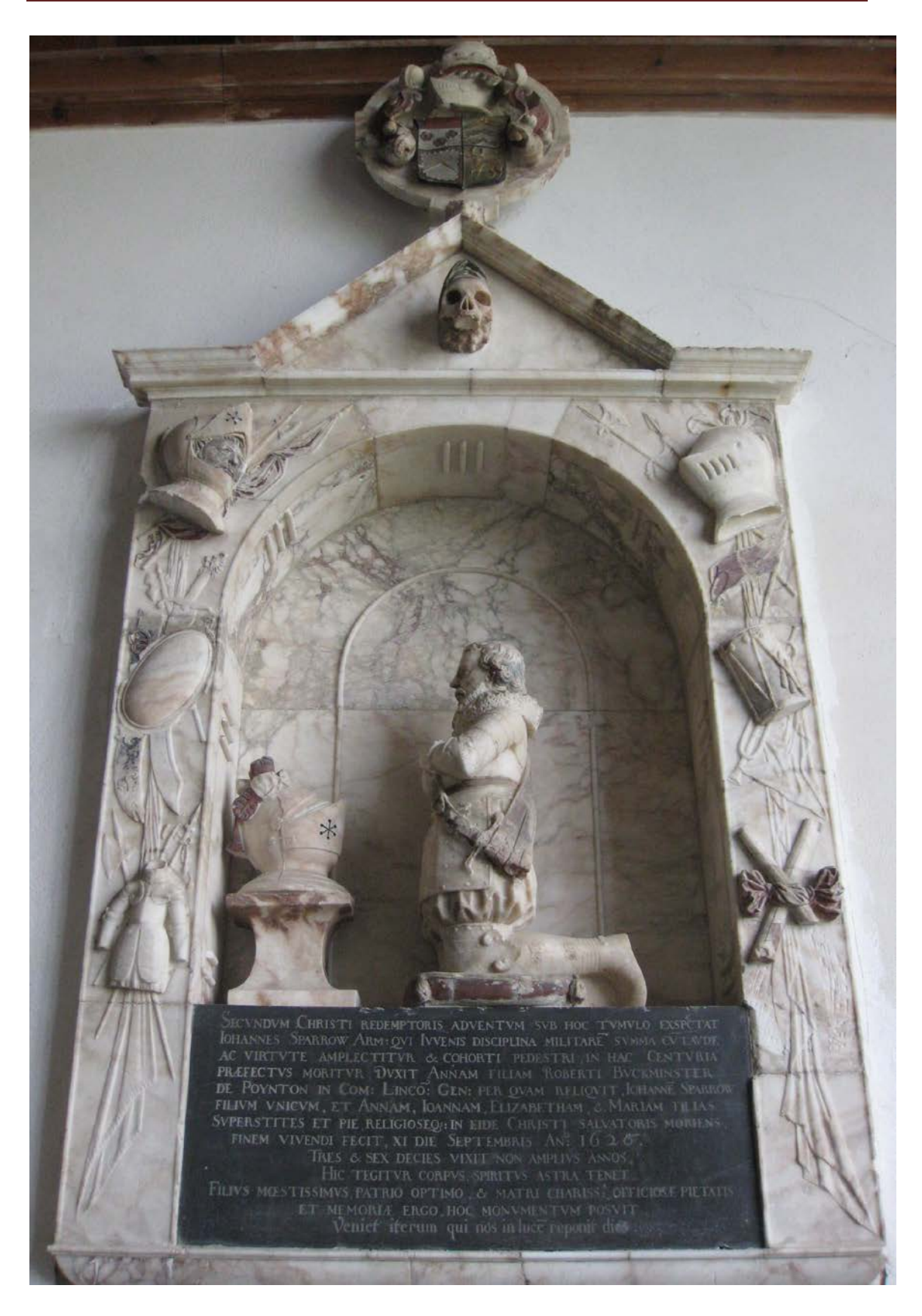
Figure 2. Funeral monument of John Sparrow senior ( baptised 7 November 1564 – died 11 September 1626) in the church of Gestingthorpe, Essex