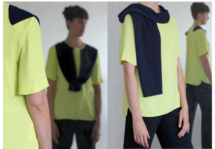
Conversation Piece #1 (2016)