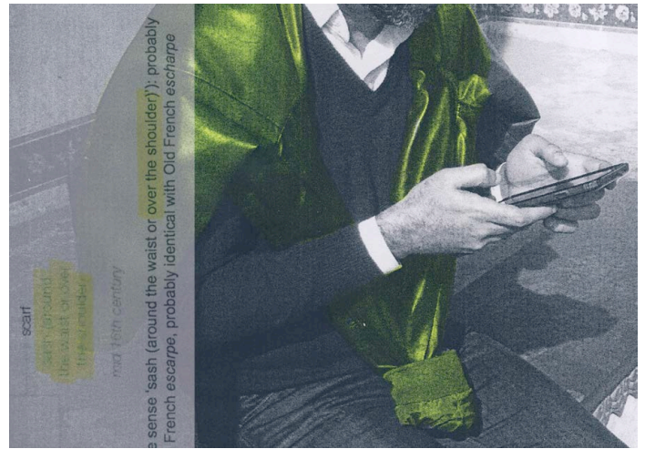
Sketch for Conversation Piece (2016)