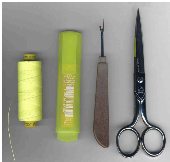
Screenshot definition of 'conversation piece' (2016)