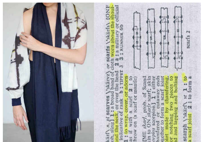
Conversation Piece #1 (2016)