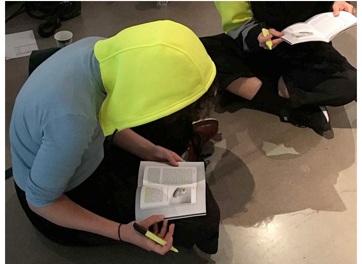
Conversation Piece #3 (2017)