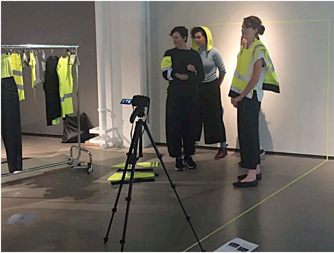
Conversation Piece # 2 (2017)