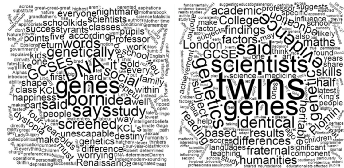
Figure 03. Word clouds for the high determinism (Left: Telegraph) and low determinism (Right: Guardian) conditions.

The word clouds were created on www.wordclouds.com . From the Telegraph text, “Brave New World” was removed, as social familiarity may lead to response bias. As media framing requires a certain exposure time to be effective (Buturoiu and Corbu, 2015), each participant was presented with their word cloud for exactly 60 seconds.