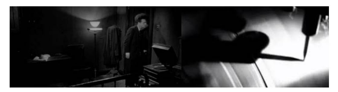
Figures 6.1 and 6.2.

"the metaphysics of crackle", Fisher finds complex nostalgia-ridden hauntological reverberations in materiality of vinyl play.<sup>57</sup> As the crackle is wrestled from the image in Eraserhead , it is allowed to take on a hauntological life of its own; or rather, we are asked to question whether this life was ever dependent on the physical apparatus at all. A similar situation arises at the beginning of Inland Empire . Opening with sound, it is a while before the hissing and crackle of vinyl is located in a black and white close up of a gramophone needle illuminated by what seems to be the beam of an old movie projector (Figure 6.2). Once located, the sounds continue over a series of fuzzy shots of a couple speaking Polish before cutting to a lady crying in front of a television playing Rabbits . And yet these things are not as embodied as they first seem, as they constantly point towards an absence. At the start of the film, for instance, the gramophone produces an announcement about a radio play that openly references the threshold transmedial play of the film's origins, a play, moreover, that is never realised: "Axxon N, the longest running radio play in history, tonight, continuing in the Baltic region, a grey winter day in an old hotel"; similarly, the television screen points out of the film to Lynch's website.