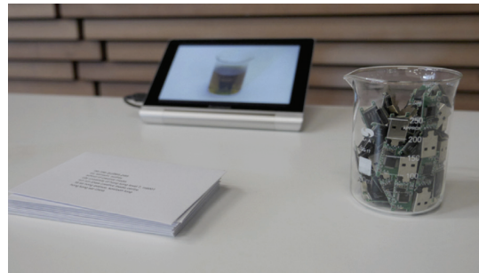
Figure 1: ne.me.quittes.pas installation.

In practice many people simply take the object home, and keep it, which is a small irony that might point to the difficulty of parting with data. The audience that engages with the piece sends their data in the post, following the literal metaphor of sending packets over the internet. The envelopes are addressed to the City University of Hong Kong, where they are then taken to the biochemistry lab to