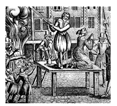
Bourreau tranchant la tête d'une condamnée (Exécution de Léonora Galigaï, 1617). PUBLIC DOMAIN IMAGE.

executing system, with the discussion moving from law and guillotine, language to langue , computer instruction and memory. In each case tracing the way in which execution produces situated posthuman couplings in a dynamic ensemble of such conjugating systems.