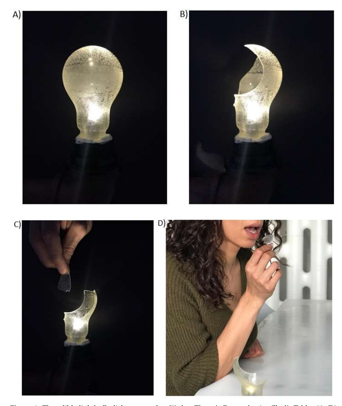
Figure 6. The edible lightbulb dish as served at Kitchen Theory's Gastrophysics Chef's Table. ( A–D ) from presentation to consumption.

both on the magic show stage (or TV show) and in the restaurant setting. The recipe for the dish can be found in the Appendix A. While this can, we believe, justly be given as an example of edible magic, it is interesting that the flavour experience itself is not magical, and the illusion is really about the texture of a seemingly inedible object.