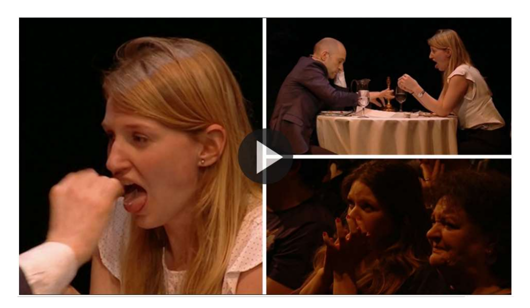
Figure 5. Fear on the face of guests as Derren Brown magically gets them to eat what looks like a shard of glass from a broken light bulb. Is one of the reasons that magical food experiences are so rare, the fact that so many examples of magic in mouth are gruesome/unpleasant. The fear is palpable on the face of the audience [77].

The British magician Derren Brown caused a stir in 2016 when he got an audience member to eat what looked like a piece of broken glass from a light bulb in front of a TV audience (see Figure 5) [77]. In Brown's hands, the audience member was encouraged to carefully pick up a shard of glass with a napkin (meaning that the latter is unaware of the slightly sticky surface texture), and bite into it. Having done so, they were encouraged to bite a slice of apple, presumably masking the sweet taste of the sugar in the glass candy.