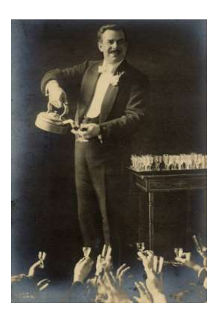
Figure 2. Devant and his Obliging Tea Kettle [36].

This style of magic trick was followed-up very successfully by 'Think-a-Drink Hoffman', who can be seen performing his routine on B&W TV show on the following YouTube clip [43]. According to Wikipedia: "Charles Hoffman, known as "Think-a-Drink Hoffman", performed one of the best known examples as a vaudeville act. His show used a small bar and a series of cocktail shakers which he used to produce any drink the audience asked for, up to eighty different drinks according to his own press materials. During Prohibition, he would produce alcoholic drinks at private shows, and became known as "The Highest Paid Bartender in the World"." [44,45].