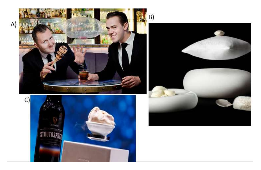
Figure 3. Three examples of levitating drinks/dishes. ( A ) Bar Artesian in London; ( B ) The Fat Duck floating pillow Counting Sheep dessert, in which a meringue rests on a pillow that floats and spins six inches above the table [63]; ( C ) Kitchen Theory levitating ice cream. Notice how in all three cases while the service element of the drink/dish is in some sense magical, the tasting experience itself is not.

Levitation has been used successfully in recent years in the context of both bar cocktails and desserts in the context of the fine-dining restaurant. Figure 3 shows a trio of popular examples of levitation from the UK. Note, though that while the service elements are, in some sense magical, the tasting experience itself is not.