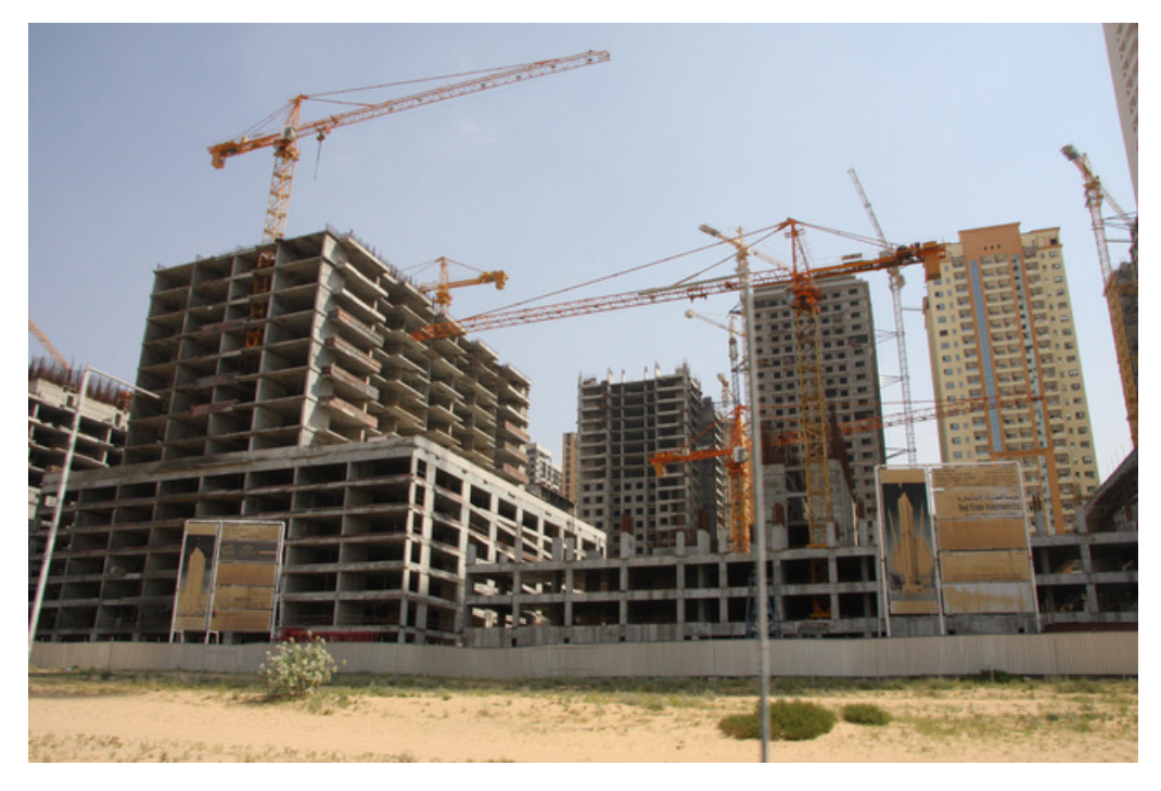
Figures 2 and 3. Emirates City, United Arab Emirates, 2014.

Even those towers that appear finished on the outside remain uninhabitable, and investors cannot take possession of their property because Emirates City lacks the most rudimentary infrastructure, such as road access. In stark contrast to the glossy advertisements depicting solitary skyscrapers amid greenery on the shores of an artificial lake, the ghostly structures are packed close together like a nightmarish vision of Blade Runner in the desert. None of the