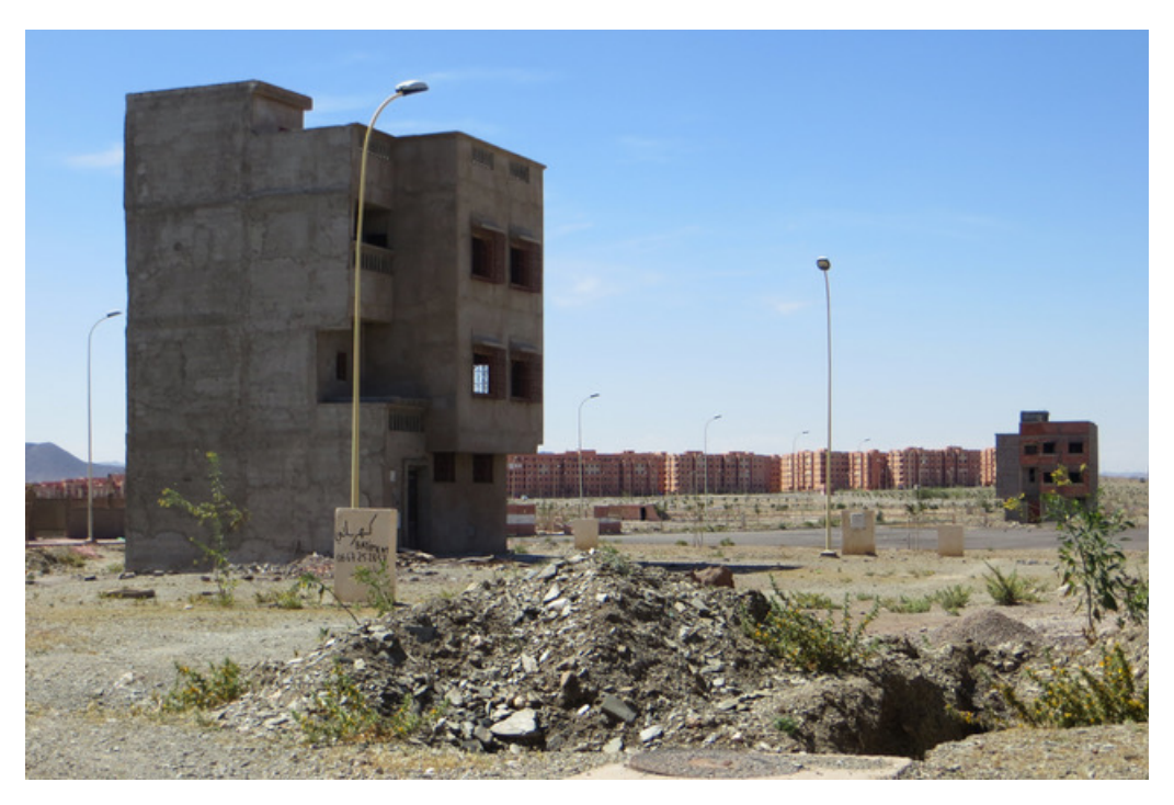
Figures 4 and 5. Tamansourt, Morocco, 2013.

From (neo)colonial exploitation and experiments with new-town planning to the design of pan-African infrastructures and modern-day landgrabbing, northern Africa has a history of providing a testing ground for all kinds of speculative urbanism. In the early 1930s, when Le Corbusier began his work on Plan Obus for Algiers, his anti-capitalist agenda of informed syndicalism led