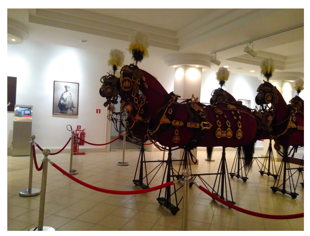
Image 4: The royal carriage on display in the Sofia History Museum.

In this respect, it is impossible to disentangle the necessity of construing an undying enemy with which to explain the faults of the present from the equally important task of constructing a past worth aiming for. As Buden explains, the structural necessity of an imperishable ghost of communism acting as an explanatory mechanism for all the present failures of the post-communist project is possible only because the societies telling these tales have accepted a logic of belatedness (ibid.). In these narratives, the period of state socialism is presented as an interruption from a normal pathway of historical development and thus efforts are concentrated upon articulating "direct links" between pre- and post-communist past. In the specific context of Bulgaria, such narratives most frequently seek to vividly animate the period of monarchic rule – explicitly framed as "European" – from the end of the 19<sup>th</sup> and early 20<sup>th</sup> century. The carriage on exhibit in the Sofia History Museum is a fitting example for such a strategic mobilisation. It is set in motion by a narrative apparatus engaged in the practice of stabilising or cutting "links" between historical periods and political phenomena construed as distinct or, conversely, as akin. This rhetorical practice articulated through and by objects like the carriage, is in service of smoothening the recording surface of post-communism.