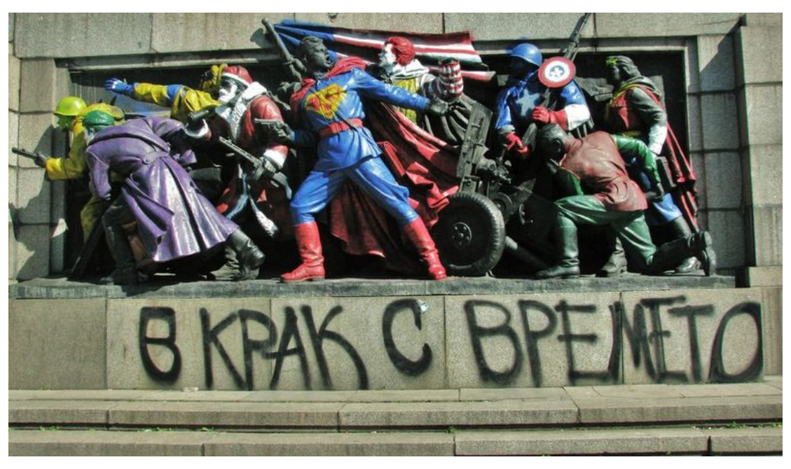
Image 23: "In Pace with the Times", June 2011.

Chapter 6 – Keeping Pace with the Monument to the Soviet Army in Sofia