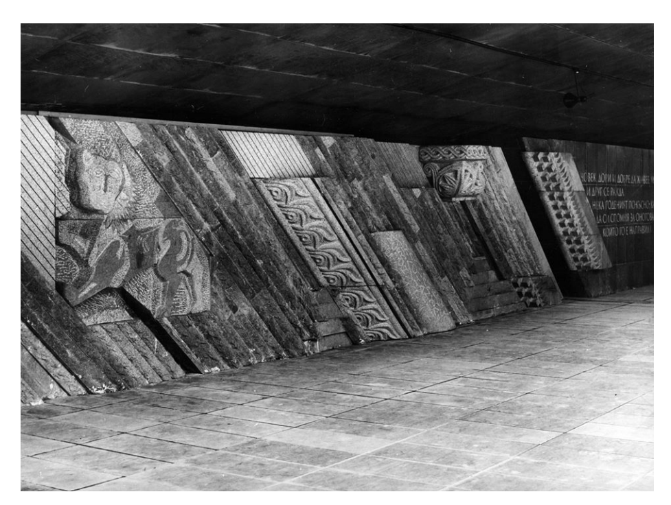
Image 7: Underground level of monumental complex with copy of bas-relief.

Despite factually buried only in 2017, many residents of Sofia had little awareness of the existence of the abovementioned lower level of the "1300 Years of Bulgaria" monument where the bas-relief was placed: access to it was impeded for more than a decade due to the material condition of the memorial – parts of the facade has started falling off, thus putting passers-by in imminent danger. This was the official, politically convenient, reason for the restriction of access to it ahead of Pope John Paul II's visit to Sofia in 2001 (Dimitrov, 2008). The underground area kept being inaccessible in the following years up to the final demolition of the monumental complex in the summer of 2017, the only visible part for passers-by remaining the increasingly exposed skeleton of the upper structure of the memorial. The pitiful state of the façade which kept shedding plates from itself, continuously prompted the question "What should be done with it?", which became "a permanent fixture of Sofia's public life", as Valiavicharska (2014, p. 193) points out. While its deteriorating material condition amidst Sofia's city centre permanently kept the monument in the focus of public attention, the engagement with its potential fate became more and more centred on its visible characteristics, while the existence of the underground level was rarely mentioned in these debates.