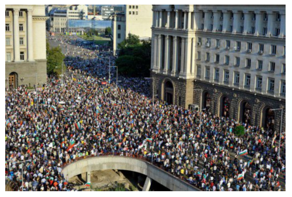
Image 34: Anti-government protesters filling Independent Square, June 2013.

representative purposes. Apart from these edifices, it previously featured two car lanes which were refurbished in recent reconstruction works.