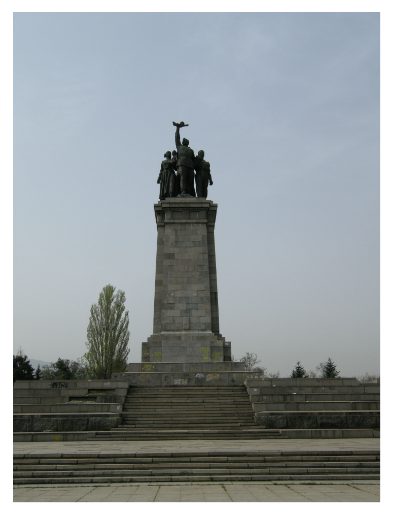
Image 24: Monument to the Soviet Army, view from the north side.

War II, that most of the material-semiotic interventions since 2011 have taken place. I will touch upon the significance of this choice in the course of the chapter.