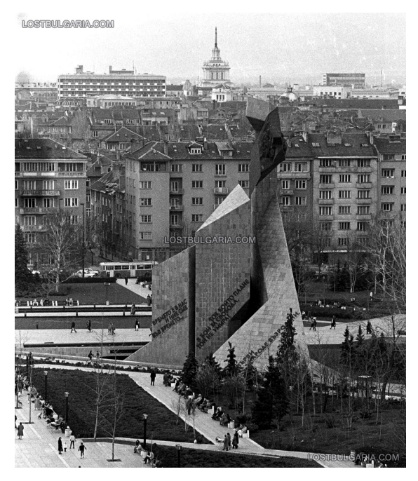
Image 6: The monument "1300 Years of Bulgaria" in 1981.