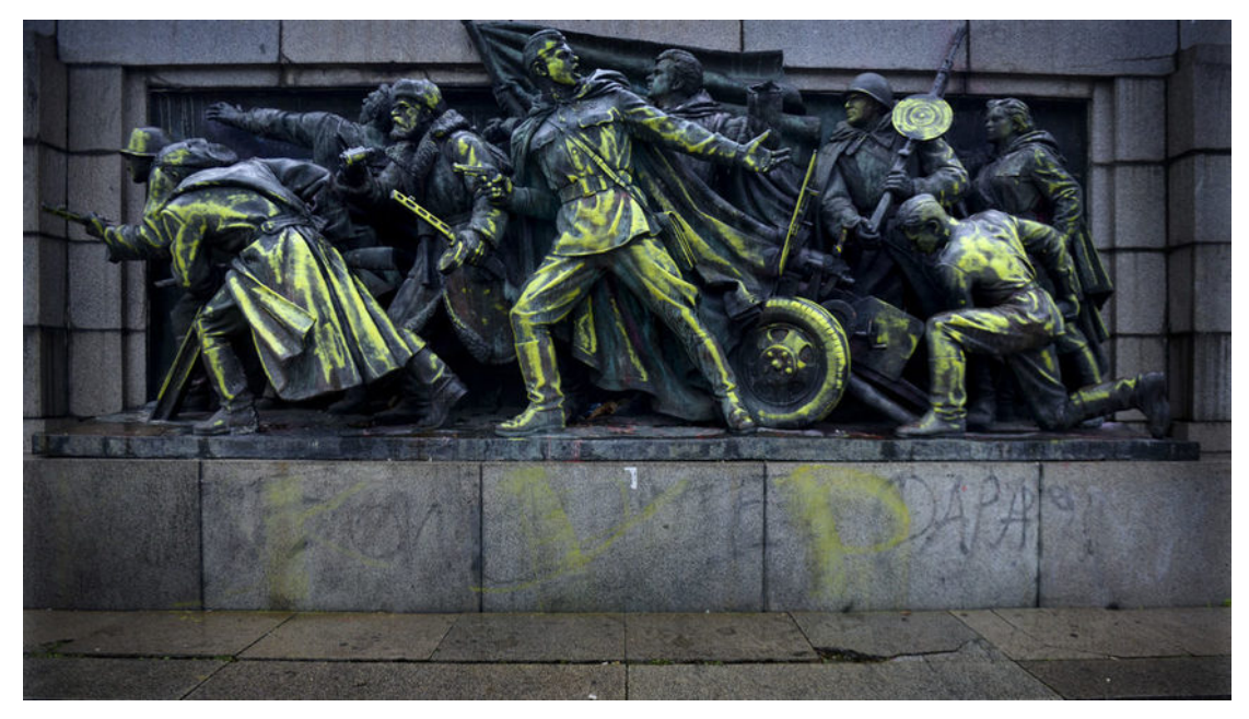
Image 31: The same part of the monument sprayed over in yellow on the 100th anniversary of the October Revolution.

Zionist occupation". Similarly to the disfigured Aliosha monument in Plovdiv<sup>131</sup> that was sprayed over with anti-Semitic and Holocaust-denying inscriptions about a month after this incident in Sofia, this case too begs questions around the disconcerting proximity of a sustained anti-communist discourse with an overt anti-Semitism.