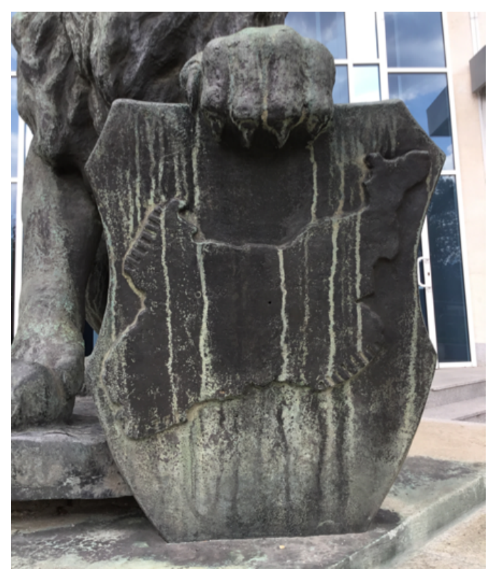
Image 9: A close-up of the map held by lion sejant.

citizen-led petition<sup>82</sup> for the reinstalment of the soldiers' monument to the First Foot Division was met so favourably by municipality and mainstream media alike and eventually its demands – to interrupt the public competition for the renovation of the "1300 Years of Bulgaria" monument and instead replace it with the soldiers' monument – were satisfied. This is arguably, because the military and nationalistic pathos with which the petition's text is imbued is very much in line with a dominant discourse attempting to establish a consensual understanding of past, present and future and modelling itself after the interests, convictions, attachments and memories of a hegemonic political subject.