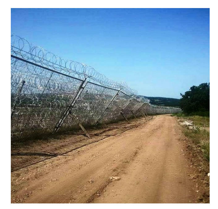
Image 20: The wall along the Bulgarian-Turkish border, May 2015.