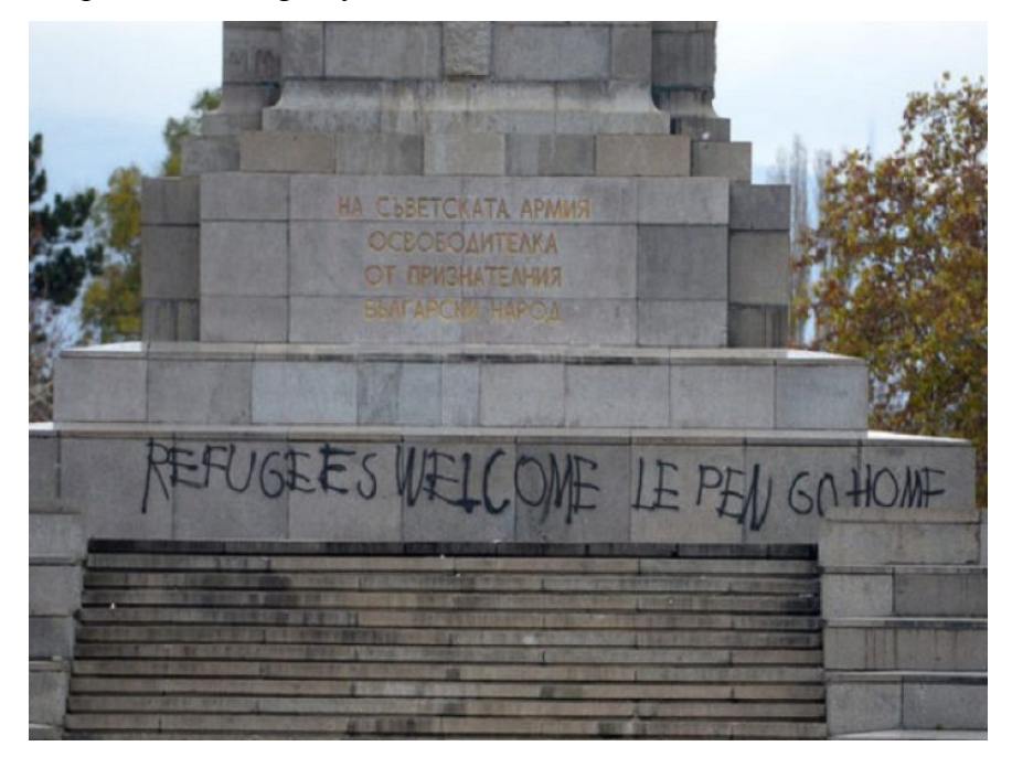
Image 32: Textual intervention at the Monument from November 2018.

prosecution pressed charges for hooliganism with aggravating circumstances, which, had they been admitted by the court, would have meant a sentence of five years in prison for the person found guilty for the act<sup>132</sup>.