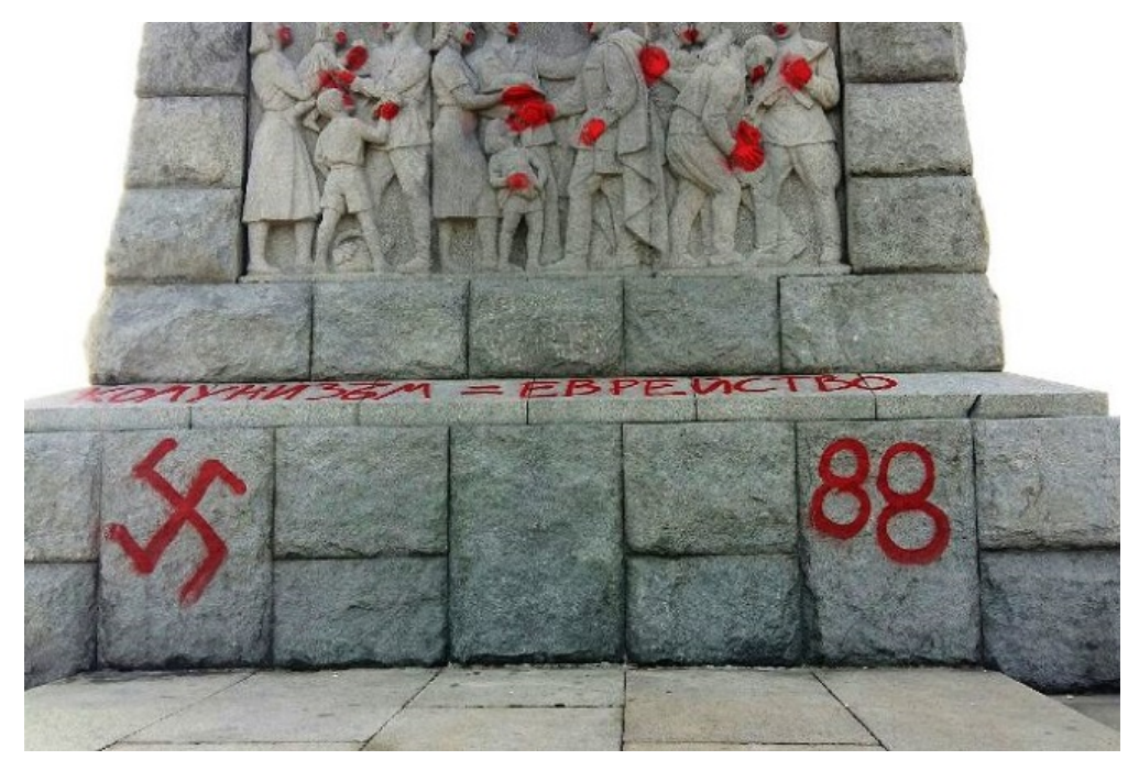
Image 3: The base of the Aliosha monument covered with anti-Semitic and Nazi symbols.

Similarly to the condemned soldier of Kafka's short story "In the Penal Colony" (2007) who suffers the engraving of a section of the law – knowable only through a sentence and thus through punishment (cf. Deleuze and Guattari, 1986, p. 43) – on his body, Aliosha's body was in November 2017 as if subjected to a punishment through a process of inscription with various signs and codes. These are not simply foreign to it but in fact thoroughly antipodal to everything the monument is meant to stand for. It was "tattooed" with numerous swastikas, the number 88, slogans such as "Kristallnacht", "Kill the Jew', "6 000 000 lies", "Communism = Semitism", "All communists – to court". The hands of soldiers depicted on one of the reliefs at the base of the memorial's pedestal were painted in crimson red. So what kind of use of history can be discerned in this intervention? Is the counter-memorial intervention to be understood as a different expression of the parodic use of history, discussed above, as it too challenges the official narrative, which has solidified in the monument it seeks to destabilise?