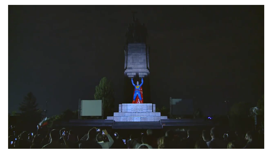
Image 28: Screenshot from video recording of 3D mapping spectacle. See the whole video at: https://www.youtube.com/watch?v=37RFUuG-7wo (Kadiev, 2011)

By far the most prominent of these acts has been the aforementioned "In Pace with the Times" intervention (Image 23). As previously signalled, it constitutes a watershed moment in the public engagement with the spatial object – not only due to the fact that it became exemplary for a different kind of interference with the Monument's materiality (prior to it, most acts on its surface were textual) and abstracted one particular element from the ensemble to articulate it as a privileged site of political expression (the high relief on its west side); it was also appropriated by actors at the opposing ends of the political spectrum. While in November the same year the aforementioned anti-monument group demontirane was founded, on September 24<sup>th</sup> 2011, BSP's mayoral candidate Georgi Kadiev kicked off his election campaign with an opulent 3D-mapping spectacle at the monument. During it, a video projection animated the surface of the front side of the memorial in a way that "extracted" and set in motion different elements from it, such as animated projections of its actual building blocks. In the course of the 3D mapping, it furthermore integrated the avatars of the soldiers that were painted over the Monument's high relief earlier the same year into its own scenario.