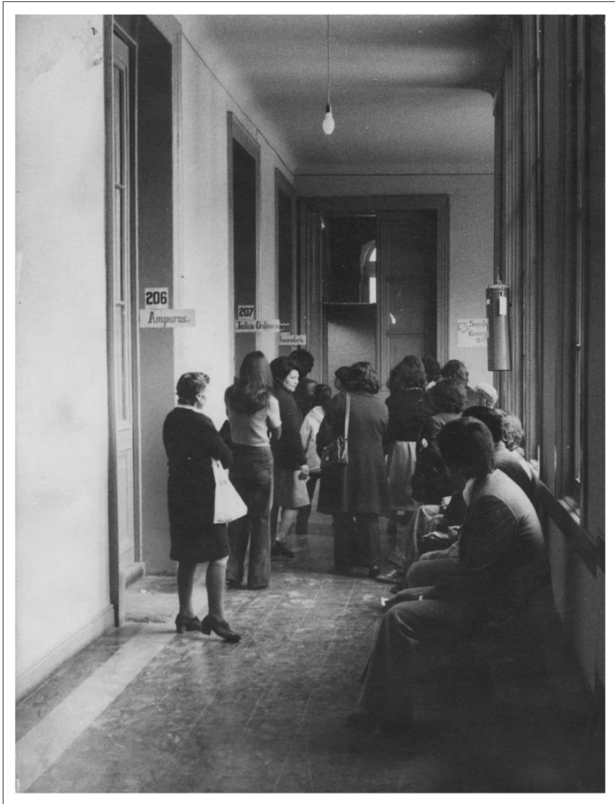
Figure 1.

(Attorney)'); these, and the bare lamp-bulb, signal that the building has been repurposed. Once grandiose, it has become functional, an improvised home to a bureaucratic institution.