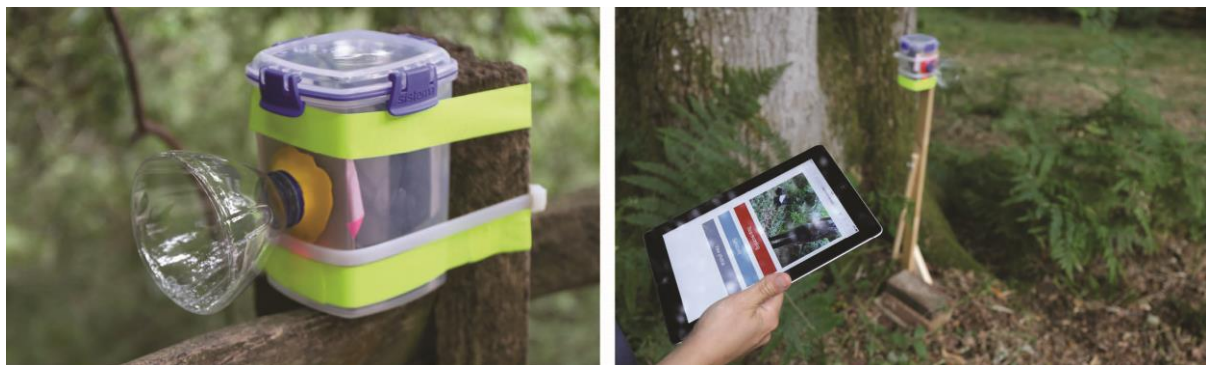
Figure 1. The Naturewatch (NW) camera is a wildlife camera using computer vision, taking pictures when it sees movement

The NW project uses a research through design approach creating DIY devices supporting new ways to engage with nature through technology. The Naturewatch (NW) camera is a wildlife camera using computer vision, taking pictures when it sees movement (Figure 1.). The NW website publishes everything to make the devices, in easy-to-follow ‘recipes’, with retail links for parts and downloadable software. NW is a collaboration between Goldsmiths Interaction Research Studio and The Royal College of Art (RCA), Design Products programme. The Goldsmiths team, took the lead in engaging the BBC, designed the cameras and instructional materials, and focused on recruiting thousands of people. The RCA team focused on using the camera in a large series of open workshops, engaging: wildlife charities, schools and cultural institutions including a training programme for communities. The deployable designs featured on BBC SpringWatch in 2018, and (to date) 2,500+ have been made by UK residents and international climates, with varying technical expertise, wildlife knowledge and demographic characteristics. Some participants directly engaged in workshop activities from either; The National Trust, Victoria and Albert Museum, Wildlife Trusts etc. (Phillips et al., 2019).