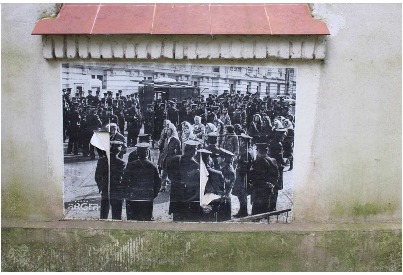
A poster of an archival photograph by Rafael Wallmann showing the Madres walking by the military, posted on the side of a wall in the ex-ESMA estate, Buenos Aires.

Rather than an autonomous entity, therefore, Memoria Abierta was initially conceived as a 'centre of documentation', which aimed to gather, strengthen and give access to the archives of state terrorism that had been already collected by six pioneering organisations in the country under one umbrella.