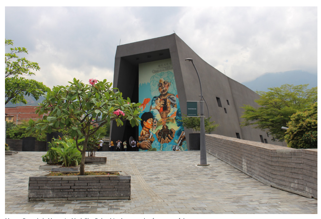
Museo Casa de la Memoria, Medellín, Colombia. An example of a successful museum of memory that shares the CNMH's commitment to work closely with the victims and local communities.