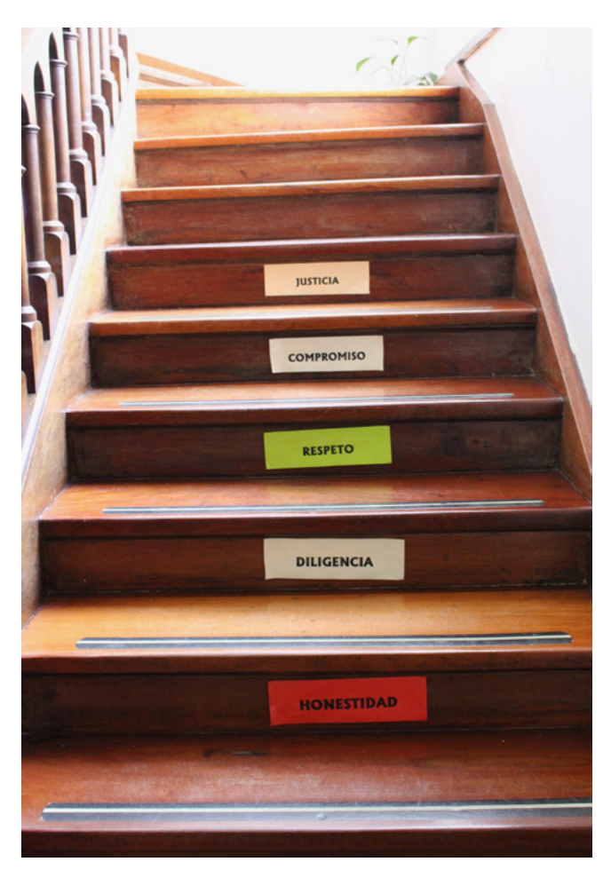
Justice, Commitment, Respect, Diligence, Honesty', the staircase at the Centro Nacional de Memoria Histórica, Bogotá. (Image: Vikki Bell)

As mentioned above, the Grupo de Memoria Histórica began its work in 2007 as part of the measures that were put in place to fulfill the requirements of the 'Justice and Peace' law of 2005 (Law 975). That law arose from the government's negotiations with the paramilitary groups, and it aimed to facilitate the peace process through its principal focus which was the reincorporation of the combatants from these illegal armed groups, mainly paramilitaries, into politics and society in general. The Grupo was set up as a unit within the Comisión Nacional de Reparación y Reconciliación established by articles 50 and 51 of that law, in order to facilitate key aspects of the legislation, the most important of which were: first, to enable perpetrators to deliver their public acceptance of their crimes in order for them to be able to receive legal and other benefits, and secondly, to produce a report that explained the rise and development of the illegal armed groups in Colombia. As will be discussed further below, the Grupo were given, for the most part, the freedom to decide the best ways to approach these tasks, and were able to use that freedom to establish structures and methods of working that were both autonomous and expansive.