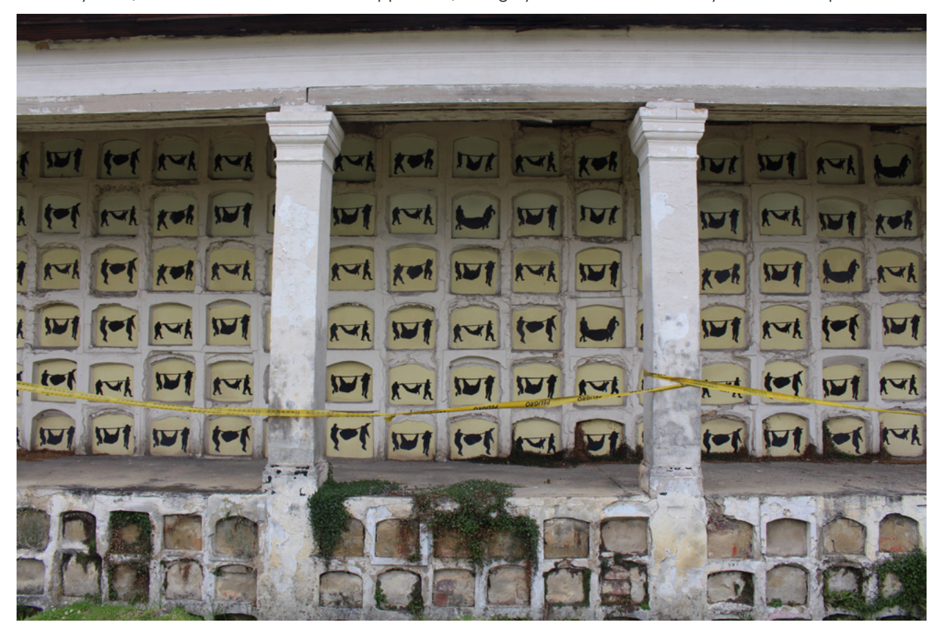
'Auras Anónimas' by Beatriz González, art installation at the columbarium of the central cemetery in Bogotá.

Thus the Centro, and the research and documentation of the armed conflict in Colombia linked to its role in Colombia's construction of historical memory, has had three stages: the first as the Grupo, between 2007 and 2011; the second as the 'golden age' of the Centro, between 2011 and 2018; and the current 'contested age' of the Centro which started in 2019 and is ongoing. By Law, the Centro will remain in existence until 2021 when the provisions of the Law 1448 come to an end (although it is possible that its term will be extended) and the Centro becomes enfolded into the planned 'Museo de la Memoria' as described in Law 1448. With their central mission to bring clarity to the complexity of the conflict, both the Grupo and the Centro have attempted to document the armed internal conflict of the country while conflict is ongoing, a task of 'memory' that is highly unusual and that many would deem paradoxical.