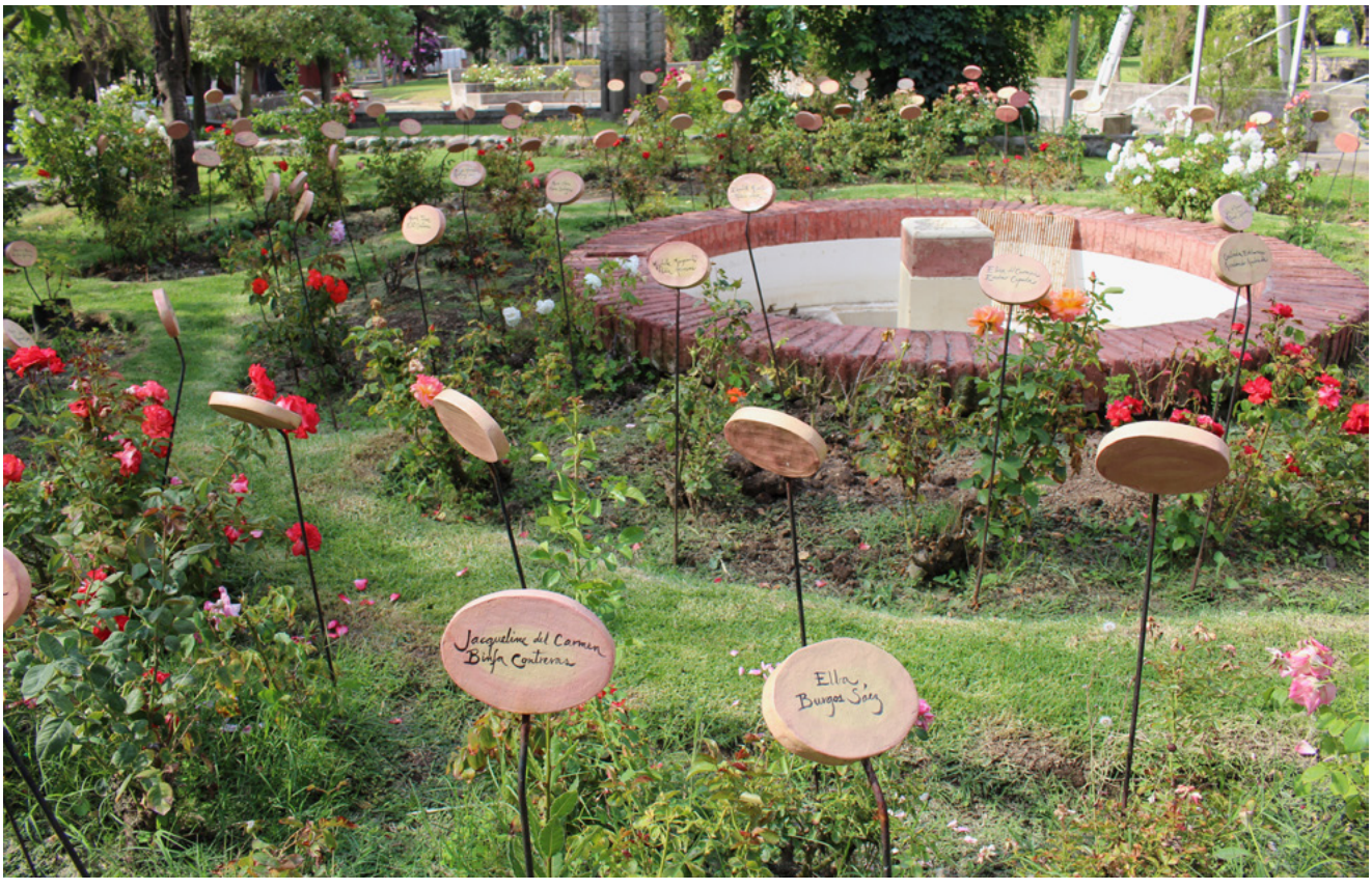
The women's garden at Villa Grimaldi, Santiago, Chile