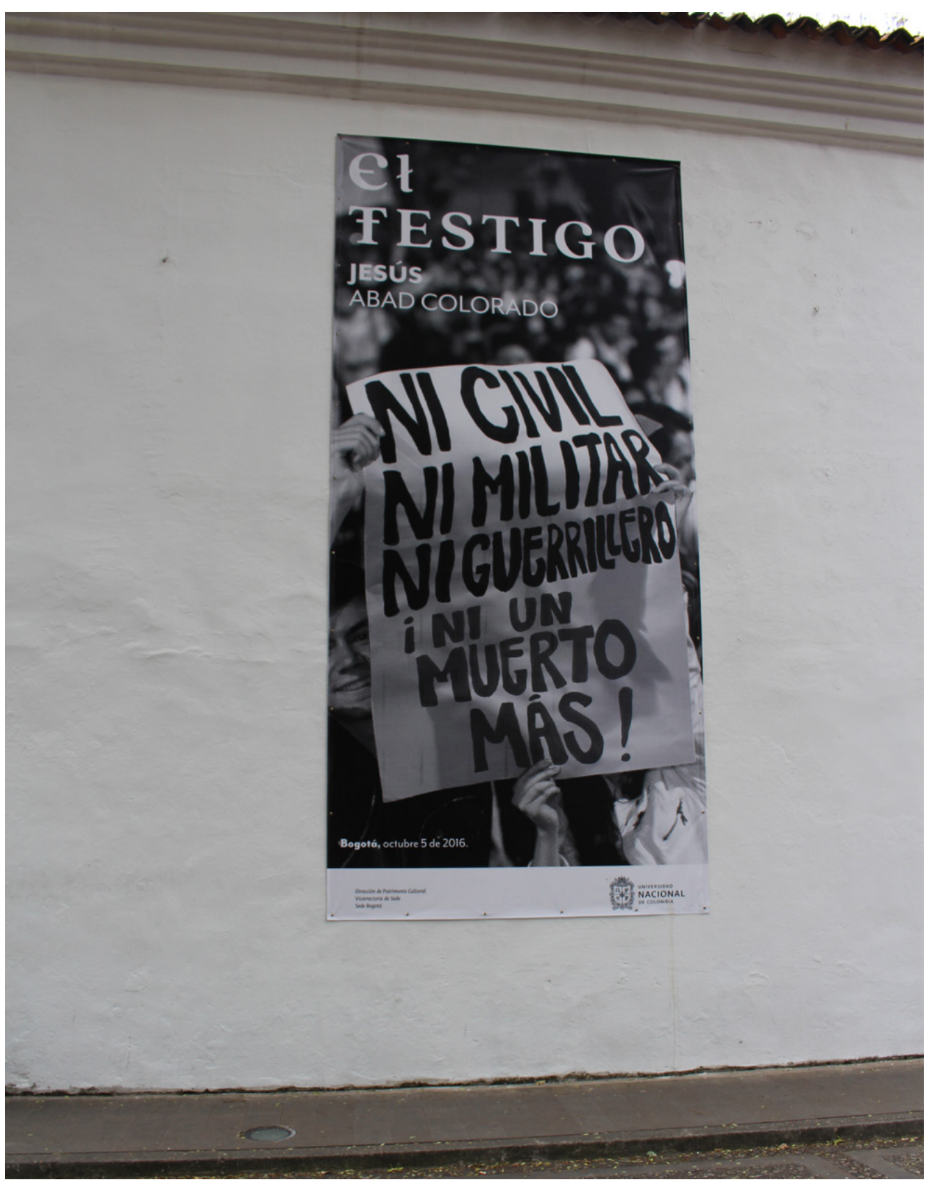
Poster for the exhibition of Jesús Abad Colorado, 'El Testigo' (The Witness) at the Art Museum of the National University of Colombia, Bogotá, 2018.

Vergara, M. (2009) 'Fundación Documentación y Archivo de la Vicaría de la Solidaridad' in Corporación Parque por la Paz Villa Grimaldi (eds) Acceso Público a la Memoria: el Rol de los arhcivos testimoniales en la democratización de las sociedades postdictatoriales Santiago: Corporación Parque por la Paz Villa Grimaldi pp 69-79