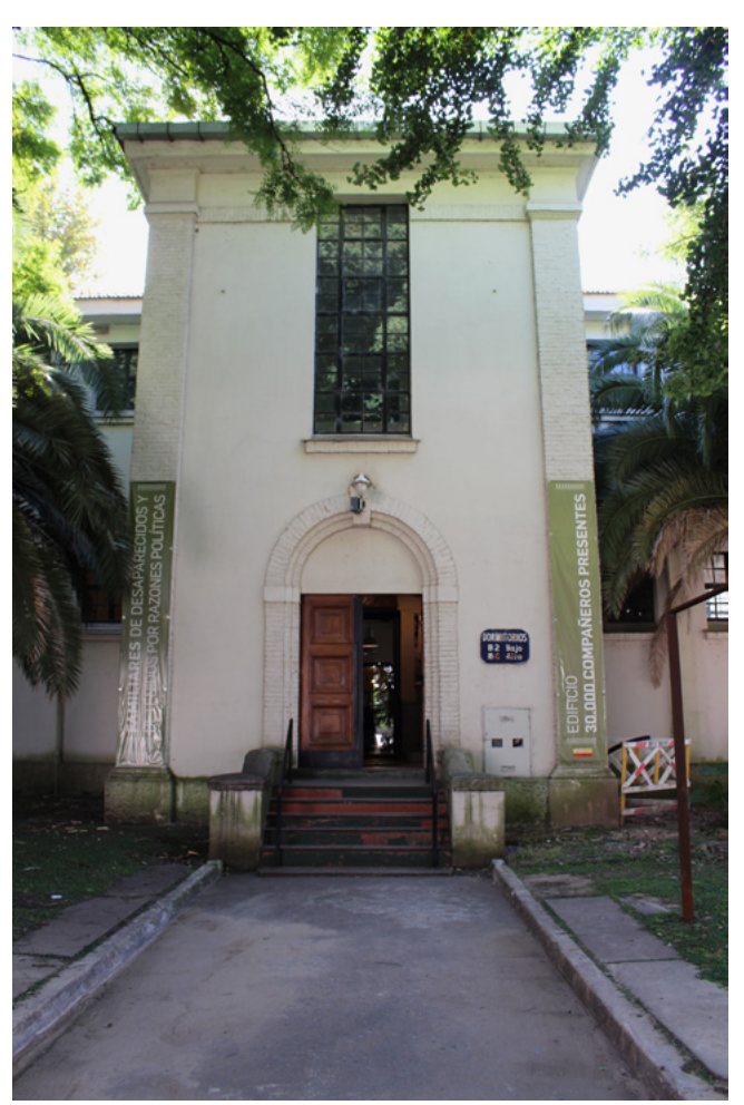
The entrance to the building where Memoria Abierta is based in the ex-ESMA estate. Once a dormitory, it has been renamed the '30,000 campañeros presentes' building.

Although as we have seen Memoria Abierta was not intended to be a deposit for archives itself, in 2005, while working with international NGOs such as Archivists Without Borders, the organisation started receiving personal archives donated to the institution. 'This