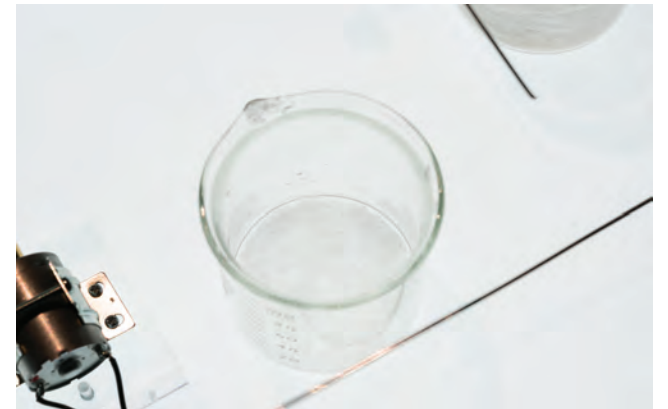
transition [characteristic], 2017