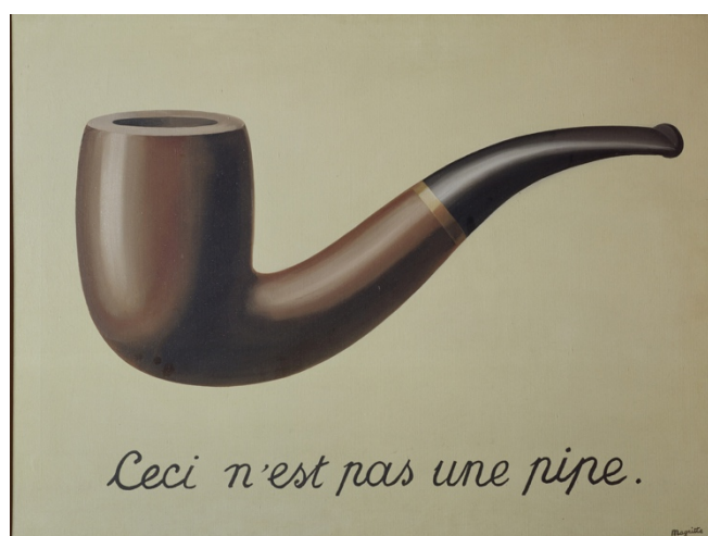
Figure 1: René Magritte's The Betrayal of Images: 'Ceci n'est pas une pipe' , 1928-29 (oil on canvas)

Starting from the realm of art, this chapter attempts to synthesise some common insights across selected works of René Magritte and M.C. Escher (section 2), both of whom employed disjunctions, paradoxes and illusions in their art. Building on them, it explores their relevance to understanding certain aspects of mathematical modeling in social sciences, especially in economics (section 3). It argues for a more prominent recognition and even a celebration of the relatively unsung virtue of modeling: to highlight paradoxes and impossibilities that lie beneath various representations (section 4). Despite their subversive character, creative disjunctions can play an important epistemological role by advancing our understanding of the nature and limitations of models, while opening up the space for new concepts and conjectures. A case for the fruitfulness of such an approach in economics is illustrated by drawing examples from the works of Kenneth Arrow, Piero Sraffa and Vela Velupillai. Each of them, in their own way, used formal frameworks to show impossibilities, indeterminacies and undecidabilities, thereby forging new ways to think about economic problems.