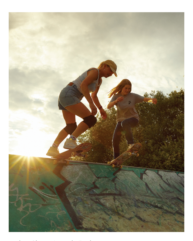
Figure 1. Skating together.