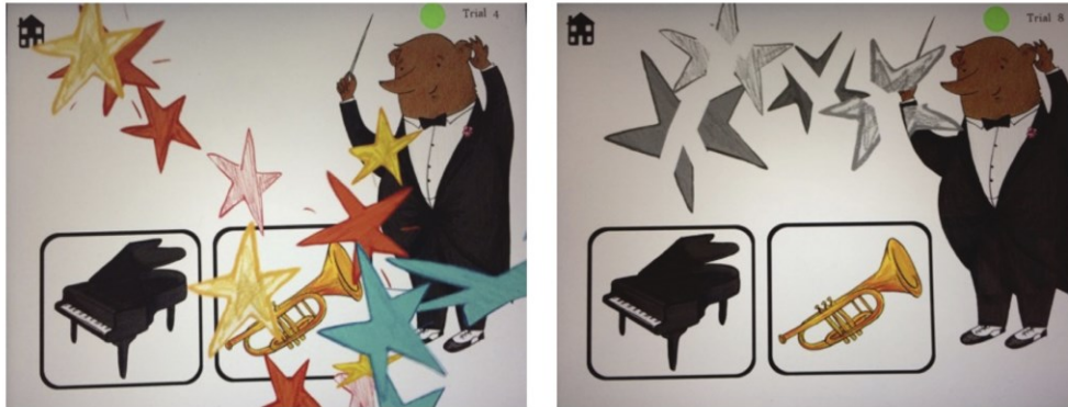
Figure 1. Positive and negative feedback from the TimbreApp melodic priming paradigm.

Language screening test. A Language screening test (British Picture Vocabulary Scale; Dunn, Whetton, & Burley, 1997) was administered to all participants with the aim of determining whether they possessed an adequate level of English language understanding. Age equivalent standardized scores were used in subsequent analyses.