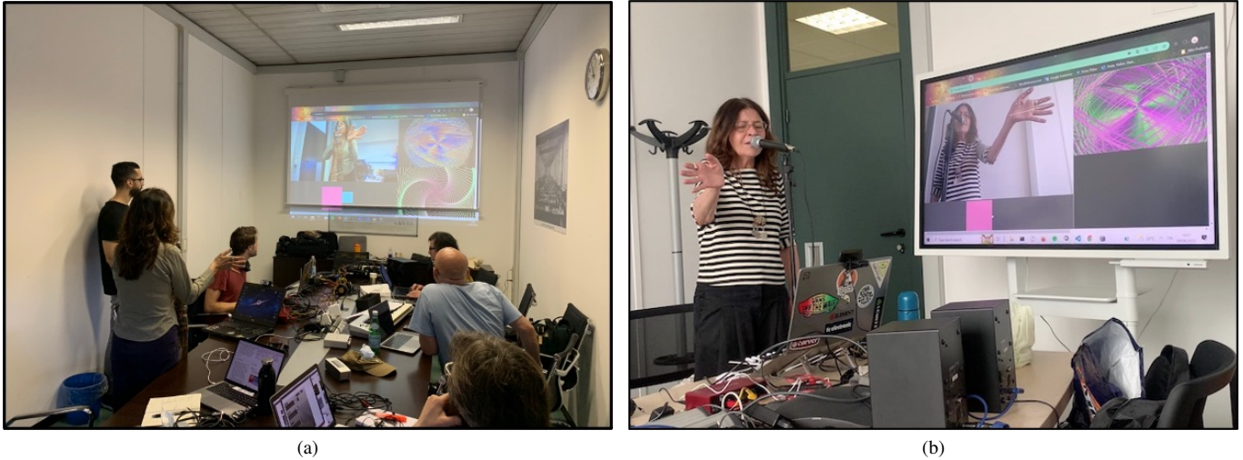
Fig. 3: Testing the Handmonizer during the workshops at Politecnico di Milano, Milan, Italy.

if the pitch detected from the singing voice is a C4, then the system considers the C major scale, if the chosen patch contains the 3rd - 5th intervals, then the corresponding 3rd is a E and the 5th a G. The two higher voices will then correspond to E4 and G4, while the lower ones to E3 and G3.