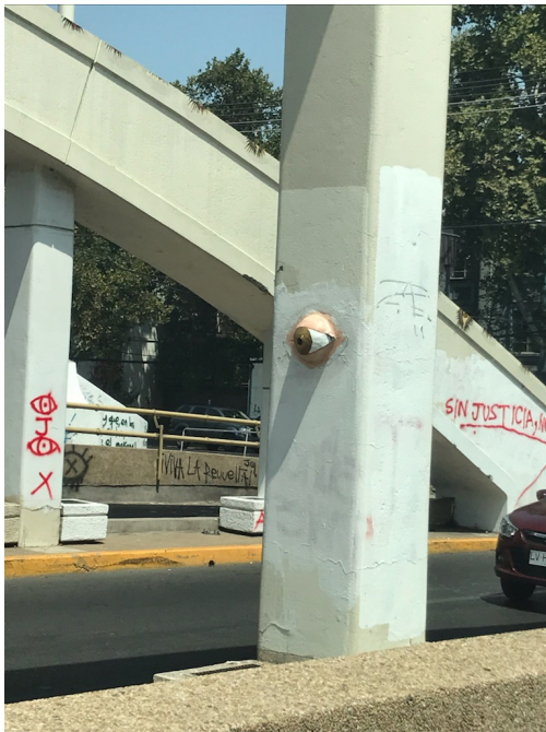
Figure 3: Signs of public protest using eye imagery, Santiago, Chile, November 2019

that is going on’, including ‘news about cops hitting people’ and ‘fires in Australia’. 8 This is a strong statement of the participant’s understanding of themselves (and the app) as being part of a whole, an ensemble of relations that extend beyond the immediate situation of interaction with the app. Nevertheless that this participant did not make any connection between Big Sister and the ways in which the protests happening at the time of the interview were being visualized by protestors through a public iconology of eyes (Fig 3; see also https://en.wikipedia.org/wiki/Eye_injury_in_the_2019%E2%80%9320-Chilean_protests ) suggests that the potential multiplicity of part-whole relationships is not easily recognized by users, and that wholes are themselves always partial.