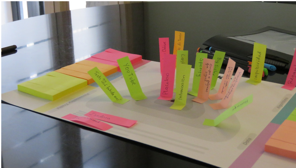
Figure 2: The Big Sister kit