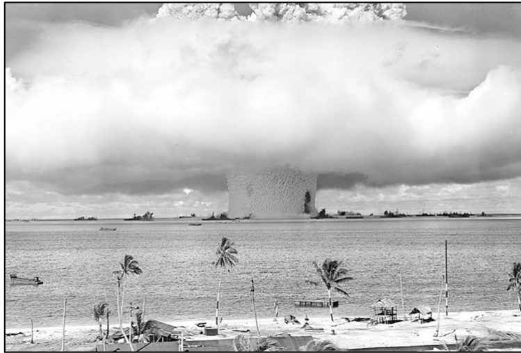
(Operation Crossroads, Test Baker as seen from Bikini Atoll, July 25, 1946)