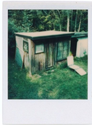
Walker Evans, Untitled Polaroid 1973-1975

This sense of luminosity, chiefly aided by the use of the Polaroid's colors in the landscapes and architectural studies, is there in some of the letter Polaroids as well. Together with Evans' continued focus on vernacular forms of signage, the presence of mass media and advertising is put to one side in favor of a more homespun version of American iconography. This is material that takes its cue from Evans' fascination with the persistent presence of the vernacular even within an urban environment rather than pop culture's fascination with the signs of commodification. In fact, it is between the crevices of what may or may not be a handmade sign, of a slightly awkwardly worded public message and its more official public counterpart, that Evans most visibly references as well as departs from his earlier work.