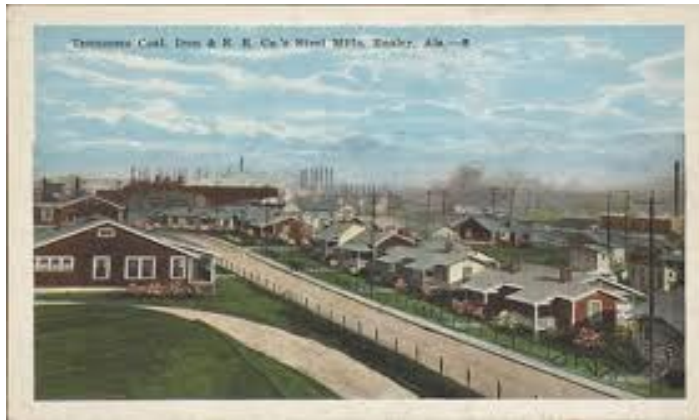
From Walker Evans' Post Card Collection

that is similar to that of the Polaroid; it can be passed around easily, its portable and transferable nature makes it a picture postcard and not simply a picture.