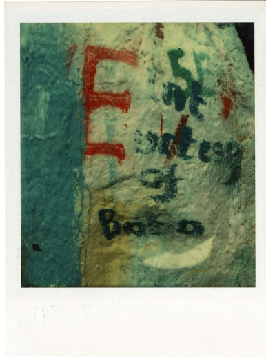
Walker Evans, Untitled Polaroid, 1973-1975

Thus, while the Polaroids continue Evan's interrogation into how photography operates as a cipher for the quotidian, they also form a critique of photography's tendency to universalize and classify the everyday, an interrogation made all the more poignant by the instant camera's status as an apparatus marketed for the everyman. Evans's interest in the discrete relationships between artifacts and signage is similar to his prewar photographs, but also tempered by a more oblique sense of timelessness.