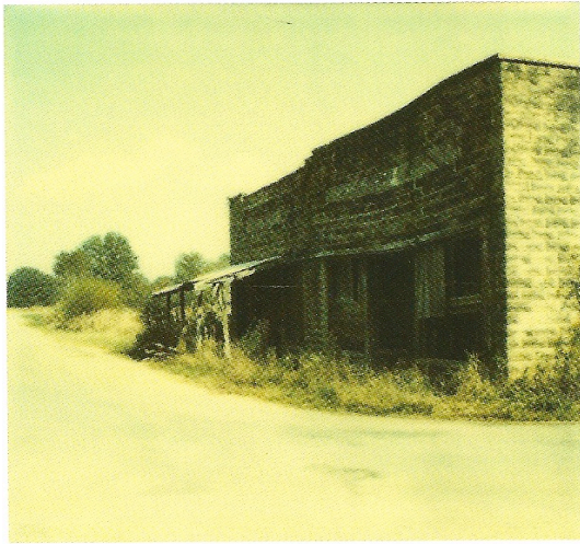
Walker Evans, Untitled Polaroid 1973

The colors of these Polaroids thus not only reflect the unique tonal qualities of the instant film stock, they also give a sense of transparency to Evans' earlier black and white images. While the intersections between photographic and ethnographic practice are still in evidence in ways that are not dissimilar to earlier work, the luminosity of the Polaroid color adds a sense of weightlessness to the scenes, a sense heightened by the lack of people within the frame as well. Rather than focus on the locations shot as staging areas for particular lives – as in Let Us Now Praise Famous Men – the structures, much as the letters, seem to be extracted and displayed for another purpose.