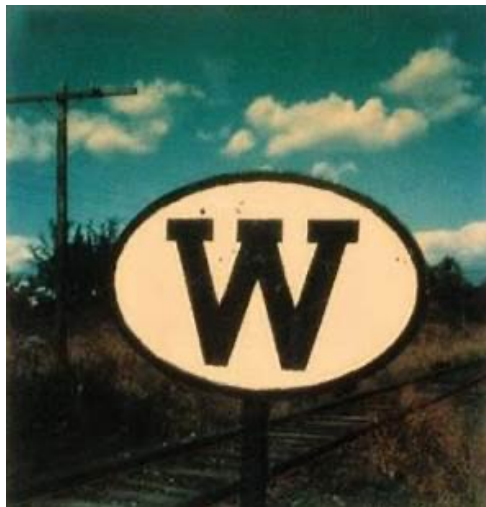
Walker Evans, Untitled Polaroid 1973-1975

Polaroid, the way in which the format lends itself to a certain proximity to the subject matter, a certain kind of intimacy. This is an intimacy that comes from more than simply the act of getting closer physically to the objects that you photograph, it is born out of the object itself - you can put the Polaroid in your pocket – it can be easily transferred etc. The format and chemical properties of the Polaroid mechanism eliminates one kind of labour (the laboratory and development) in favour of a necessarily more careful and singular consideration of what is seen in the viewfinder.