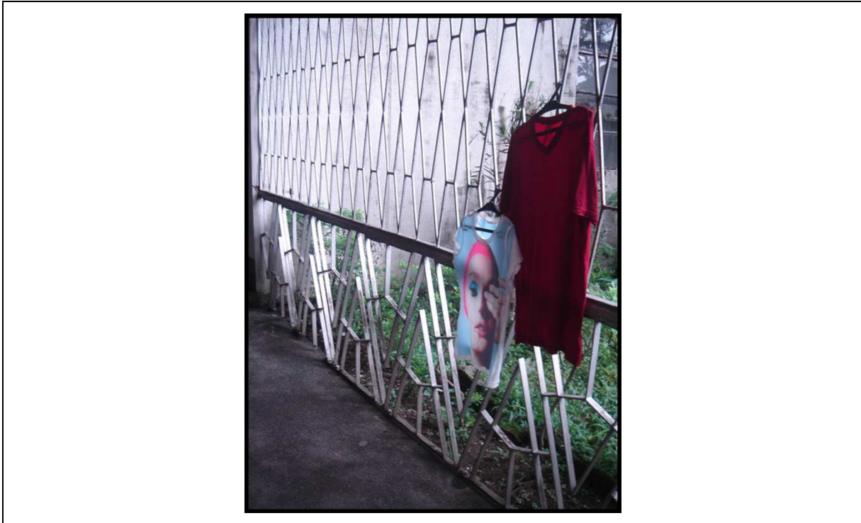
Figure 6. Photo 16 in Matt's photo essay

The key contribution of this article is that it provides insights into the ways in which photographic selection practices in collaborative research impinge on the photograph's mediational quality. Consequently, this piece also provides indications as to whether and how we might apply such practices for future collaborative projects, so that they can better foster socially marginalized voices in general and migrant cultural minority voices in particular (see Buckingham, 2009). In relation to photographic subject selection, Shutter Stories underscores the importance of paying attention to what different people involved in a collaborative research project assume to be the key affordances of photography. For instance, the photography scholars in Shutter Stories drew heavily on institutional photography and posited that a central feature of the photograph is that it works best when telling narratives that emphasize the visual language (see Harrison, 2003; Messaris, 1997). There is, of course, some truth to this idea and it did help the migrant participants create photo essays that managed to attract members of the public to engage with and meaningfully reflect on their migrant stories.