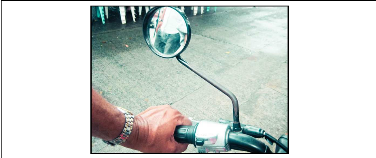
Figure 2. Photo 2 in Preet's photo essay