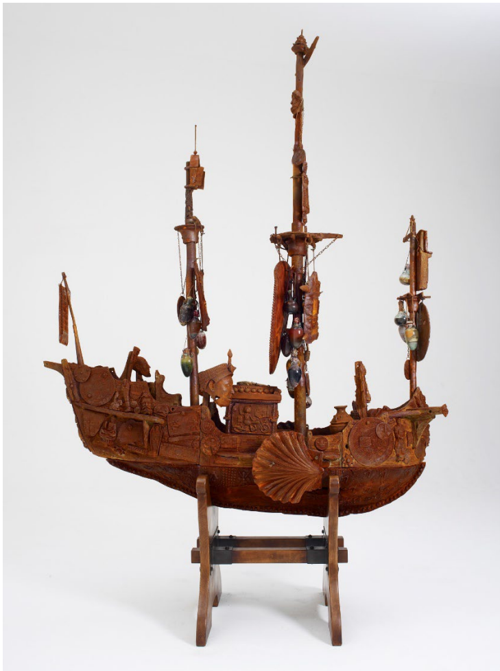
Figure 1: The Tomb of the Unknown Craftsman , 2011