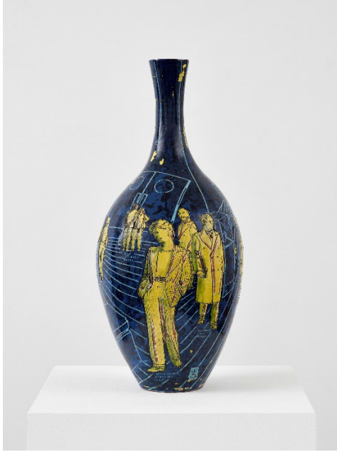
Figure 3: We Are What We Buy , 2000