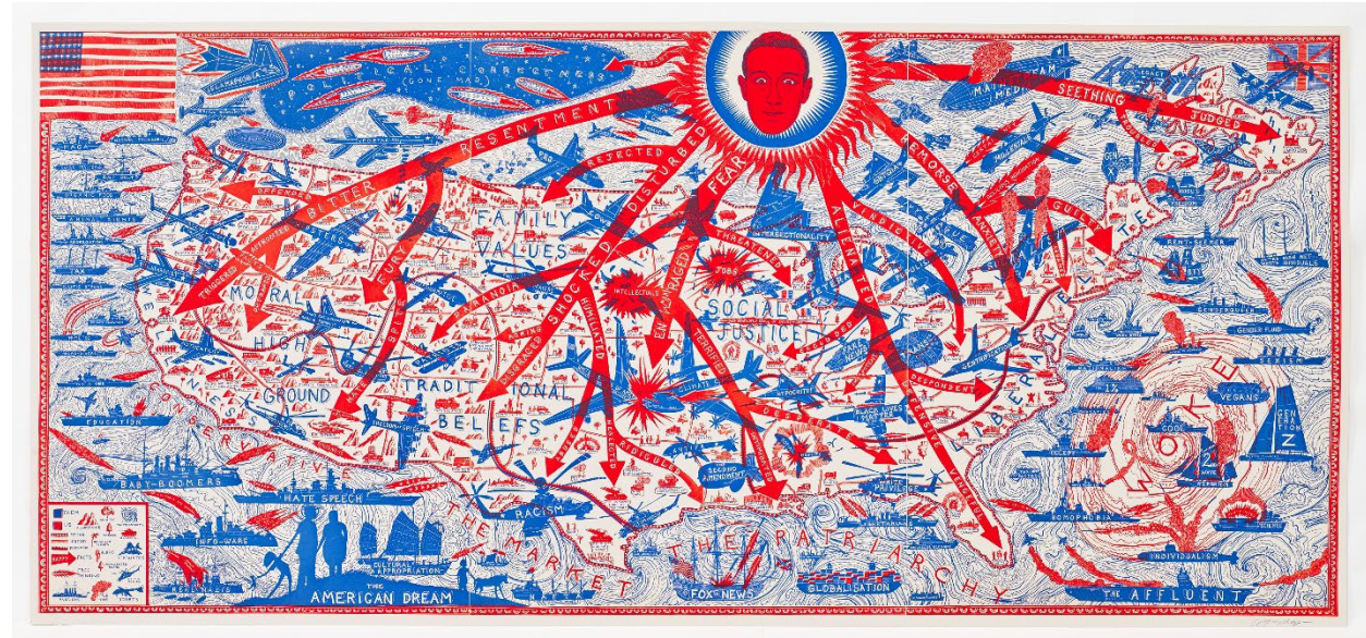
Figure 4: The American Dream, 2020

using essay mills, presenting others' work as their own (BBC 2021).