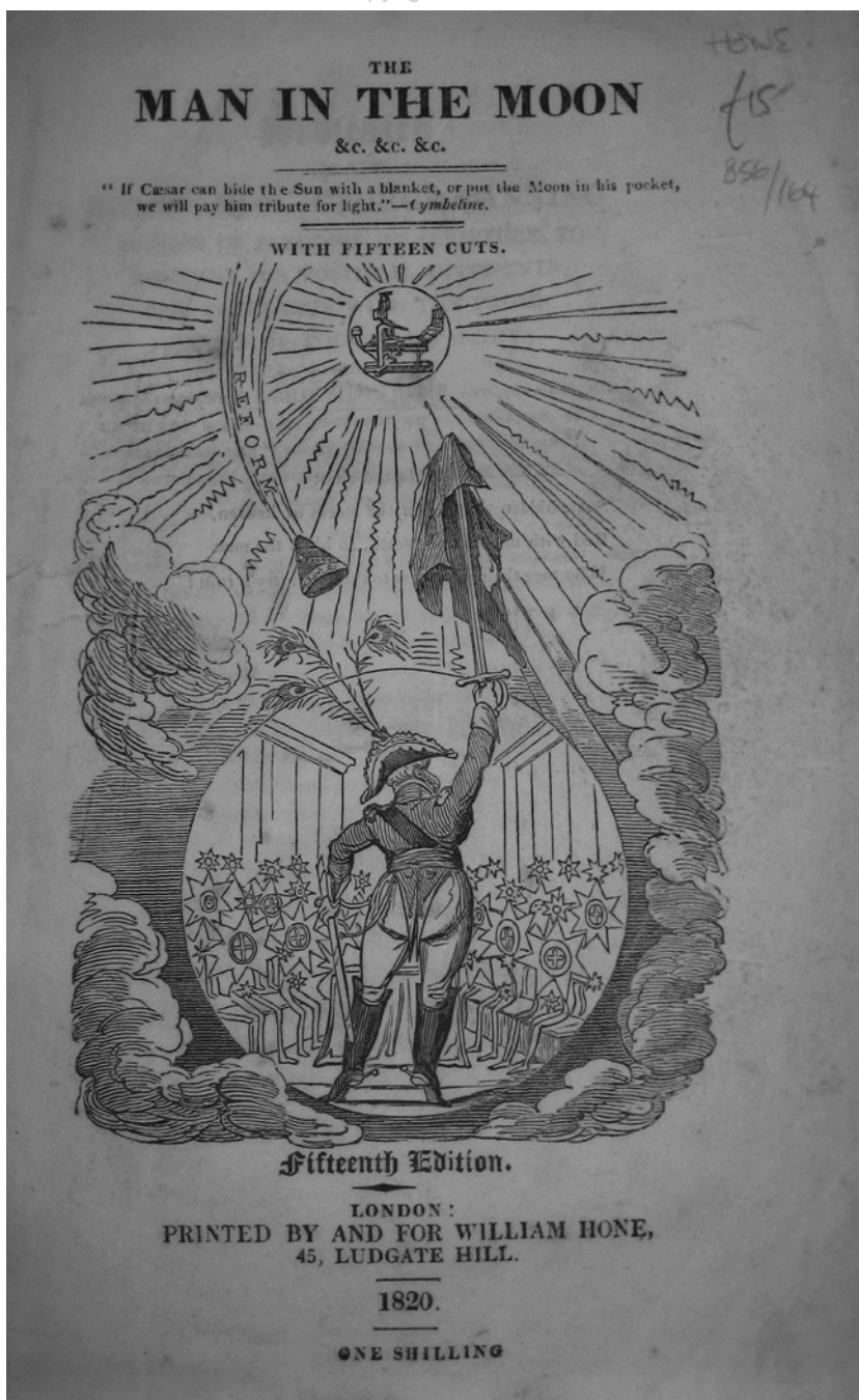
The title-page of William Hone's The Man in the Moon (1820).