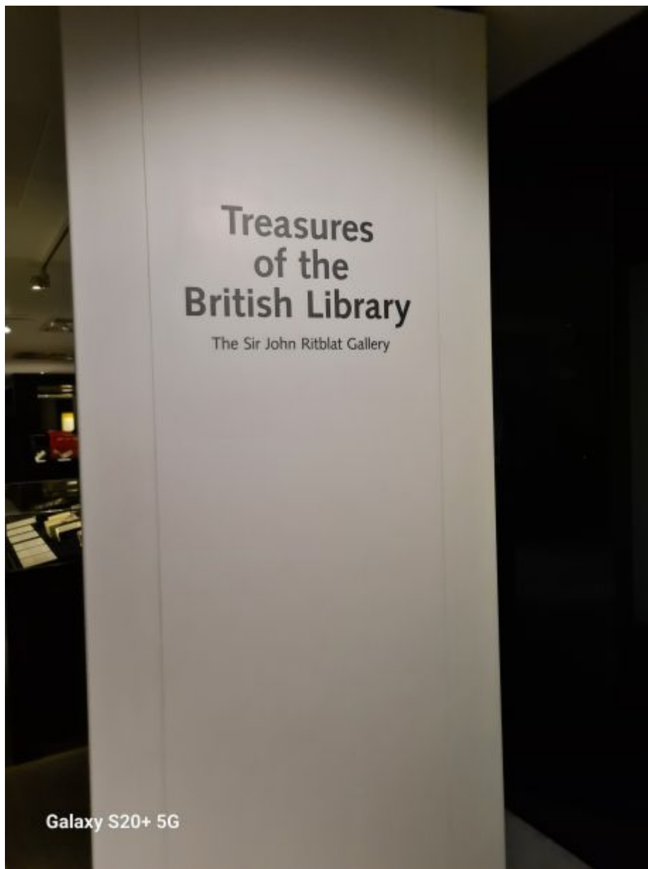
Figure 1 The gallery where many of our writers sought their inspirations!

great success. This is partly because of the diversity of people who sign up for the event; a parent with her three young children who are 6, 8 and 12 years old; a GCSE student with her mother wanting to learn more about writing; a few students, adults and teachers interested in developing their creativity skills; a published writer. They have come from all walks of life, but are united by their interest in creative writing. The British Library proves to be a welcoming space for them.