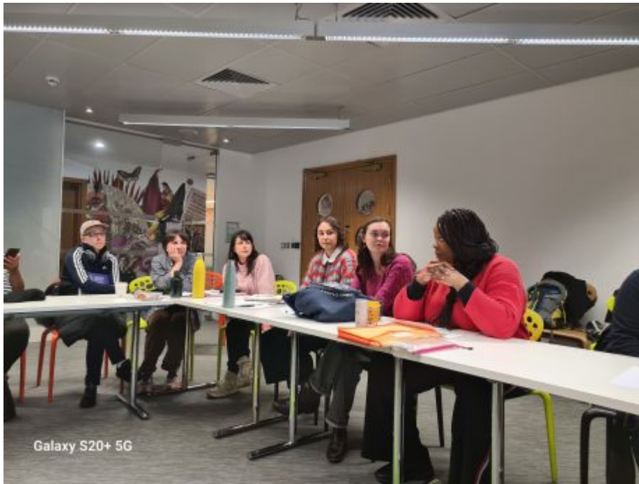
Figure 5 MA Creative Writing and Education students conferring at the workshop

Other participants learned about the importance and benefits of freewriting , the ways in which writing can unlock new perspectives, using history and creative writing to unlock creativity, and enjoyed being guided through the library by writers.