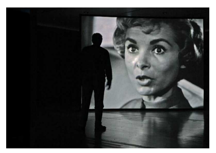
Figure 10.4 Douglas Gordon, 24 Hour Psycho, 1993. Screenshot captured at 21:27.

moment beside the other. The attempt on the part of the viewer to create a sequence is endlessly frustrated. In a sense this is pure distraction, but at the same time repeating the frustration from which distraction is meant to distract. We could contrast this with Douglas Gordon's 24 Hour Psycho (1993), which we might see rather as a late work of the 'great boredom', remediating film through video to bring together two modes of the 1950s to 1960s, the psychological horror thriller and long-duration art. It does seem to press against the limits of endurance in a way made possible by contemporary technological changes.<sup>17</sup>