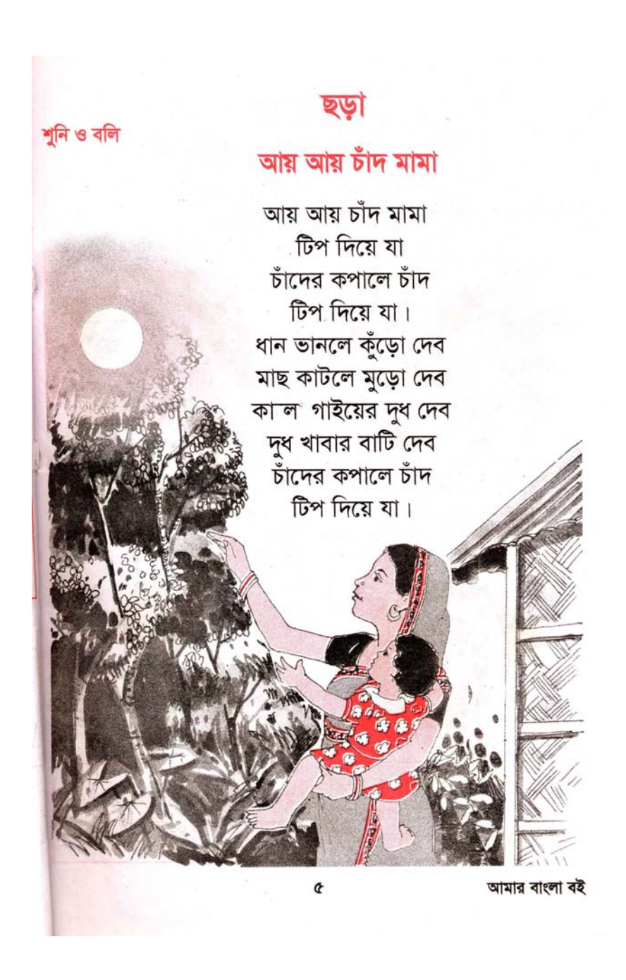
Figure 1: The Bengali lullaby ai ai chad mama (come, come uncle moon)

We discovered that a source of literature familiar to children from community class and home was primary school readers from Bangladesh, containing a wealth of stories and poems in Bengali. Bangladesh has a strong literary tradition and has produced a Nobel Laureate, Rabindranath Tagore, as well as other key poets such as Kobi Nazrul. Their writings for children are included in the primary readers, together with traditional stories and poetry. One particular chora (Bengali poem) was a lullaby called ai ai chad mama (come, come uncle moon) shown in Figure 1. Known to most of our participant children, who had heard it sung at home, it contains complex metaphorical meanings that provide an excellent resource for a classroom poetry lesson. The Year 6 teacher reported that her class loved poetry, and she was keen to explore this poem and contrast it with a lullaby in English, 'Hush Little Baby'.