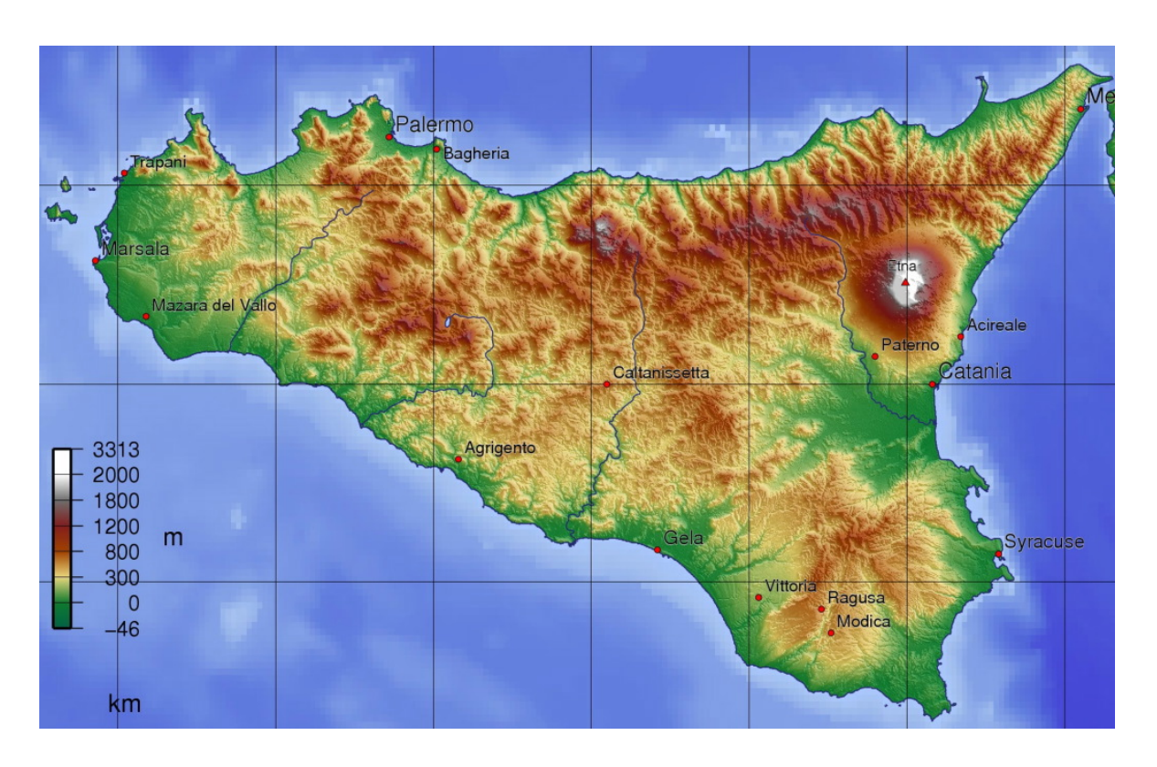
Map 2: Sicily and its geography. The farms I studied were located on the coastal plain of the large gulf that separates Palermo from the town of Trapani to the west (top-left).

Sicily is the largest island of the Mediterranean Sea and is located almost at the centre of it. With a land mass of 26,000 km<sup>2</sup>, it is the biggest region in Italy, currently inhabited by just over five million people. Since ancient times, Sicily was recognised for its triangular shape, which earned it the toponym Trinacria , a word of Greek origin meaning 'three-pointed'. The island presents a mountainous landscape, especially along its northern and eastern shores, and a tightly-knit system of undulating hills in the interior. Together, these habitats make up roughly 85% of its land mass. The rest is occupied by a few large agricultural plains, the largest of which are those of Marsala in the westernmost part of the island, and of Catania in east. The farms I studied were located on a smaller plain on the north-western shore of the island. Also in this area is Palermo, Sicily's largest city (and Italy's fifth) with a population of about 700.000. The city overlooks a wide natural harbour, a location to which it owes its name, 'Palermo' meaning 'all-port' in ancient Greek.