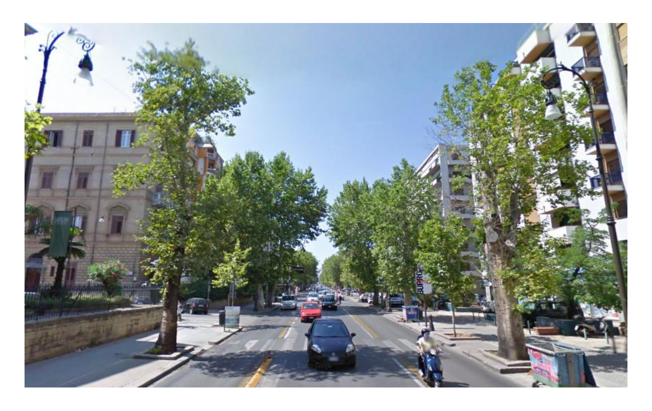
Figure 6: the 'good' Palermo today.

It is important to appreciate that the social and economic developments of the time divided Palermo's core urban body into an older, southern half, and the newer northern one just described. This is a rough distinction, as the sprawl that followed World War II to accommodate internal migration created a very composite social landscape in the valley occupied by the contemporary city (see below). Still, this geographical distinction is useful as it reflects (again, roughly) a socio-economic one that sees the northern half inhabited by considerably richer Palermitans than the southern one. The ethical consumers and the fair-trade shops I introduced earlier were all located in this area, as was the English Garden were the farmer's market took place (see Map 1, page 52).