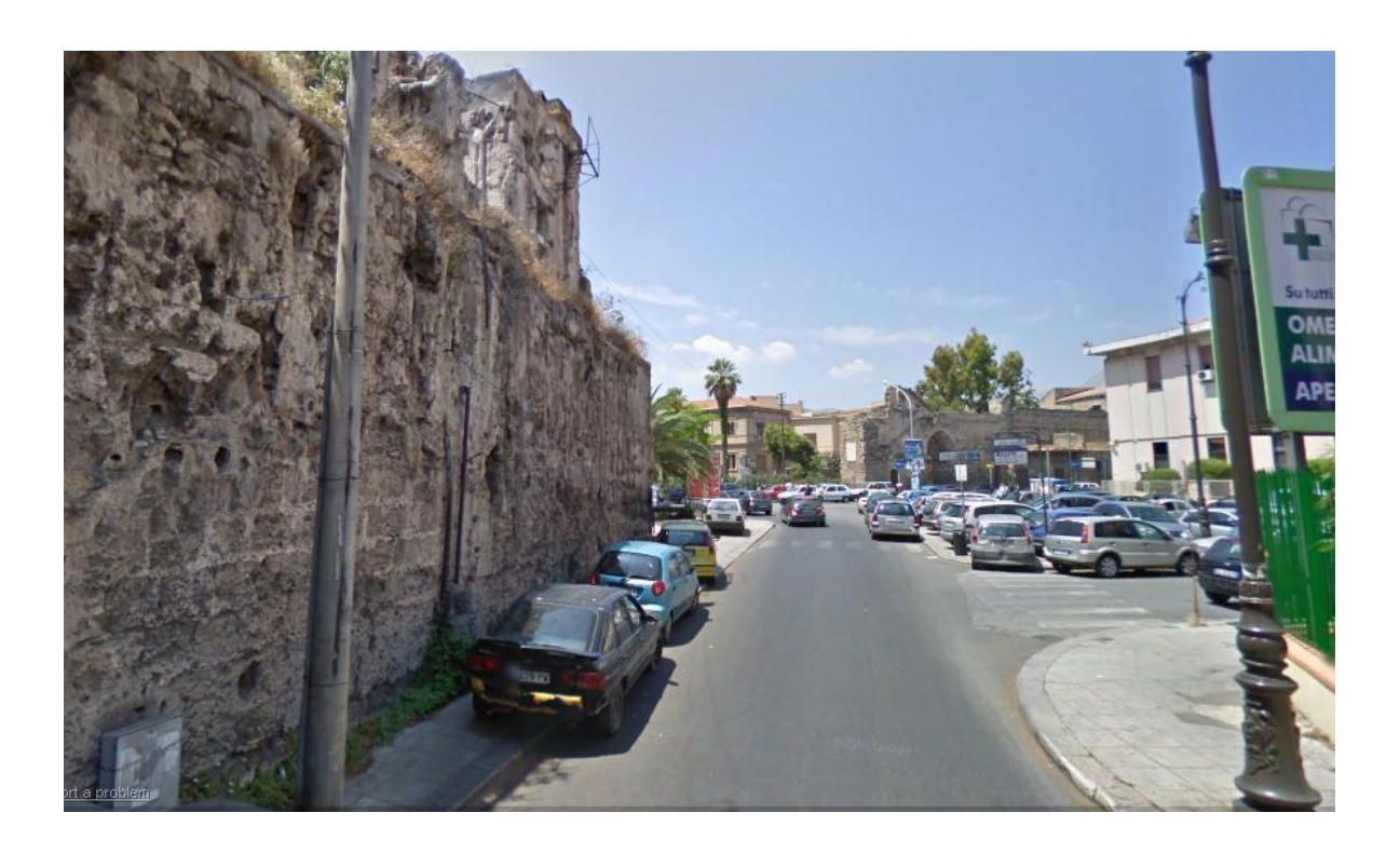
Figure 4: the ancient water system on the left, the hospital on the right.

After crossing a double-carriage road, I reached the metro station named after the adjacent Royal Palace of the Norman kings. After the year 1000, the Normans founded an autonomous Kingdom of Sicily, ruled from Palermo, which extended on mainland Italy up to Naples. Their reign is considered by many the pinnacle of Sicilian civilisation, when the arts and sciences thrived (though a less Catholic-centric perspective would say the same of the previous Arab age).