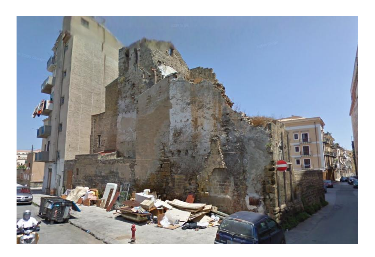
Figure 2: the church remains and building in question. The street seen disappearing in the background to the right is via Albergheria (notice the new-looking building at the start of the via )

Though the Albergheria was at the heart of Palermo's political, economic and cultural life throughout most of its history, in the 20<sup>th</sup> century it became one of the city's most impoverished and dilapidated neighbourhoods. Clear signs of this are still visible everywhere. But in the last couple of years, a process of regeneration that started in the late 1990s has considerably accelerated. Thanks to public subsidies, many buildings that were once decrepit have been made new. Their facades are painted with colours resembling the old stonework, dark wood is used for outer doors and window frames, and retro-looking lamps are fitted to their perimeters.