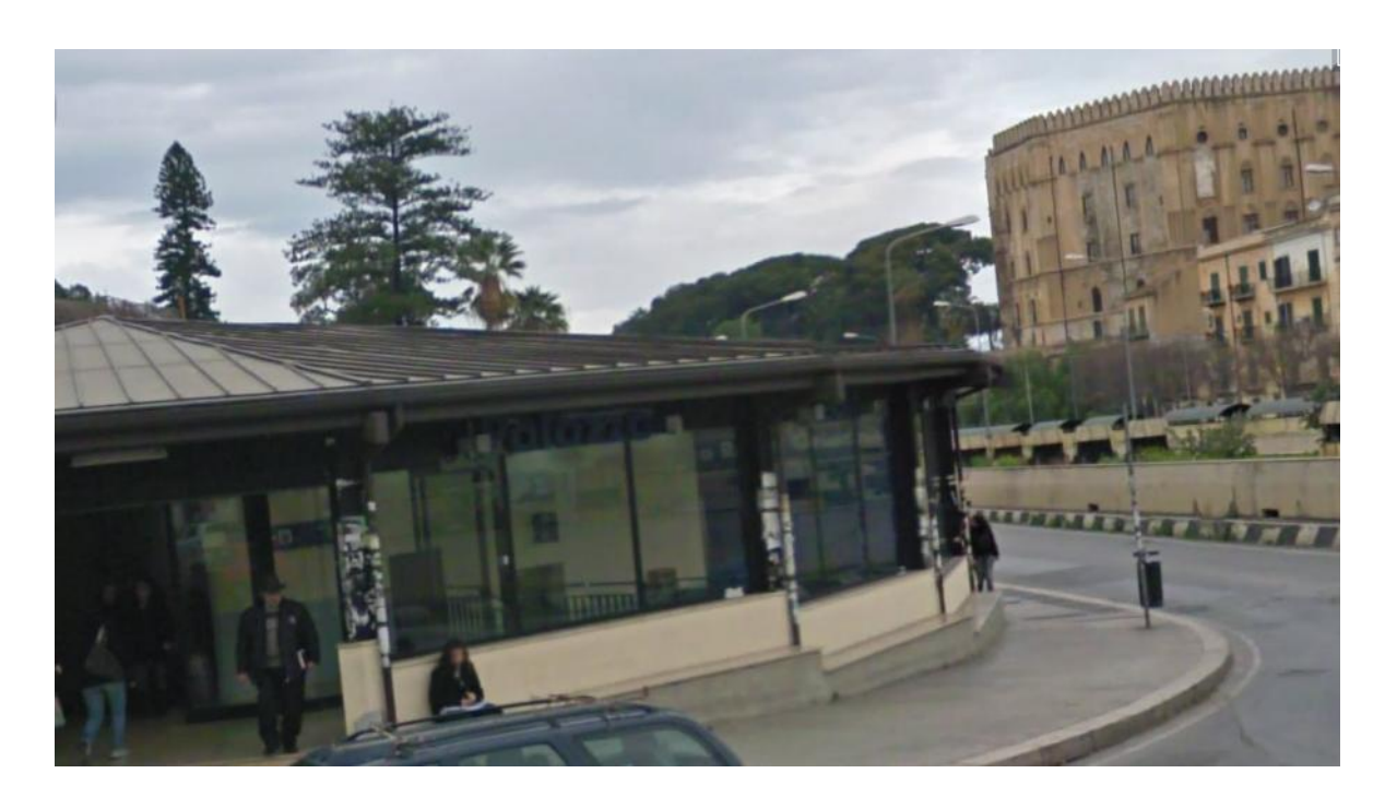
Figure 5: the metro station, with the Norman Palace in the background.

Unfortunately, the metro still connects only a handful of spots throughout the city, and runs only every half an hour. This meant I had to take the bus to reach the public garden where the farmer's market took place. The station is located on one side of a large square, Piazza Indipendenza , overlooked by the Norman Palace. The square acts as a buffer between the old and the new city, and is one of Palermo's main bus centres. Heavy traffic usually blocks the many roads departing from it, but today was Sunday. The bus I needed was parked, so I got on and waited. I noticed the vehicle was from the new fleet of greener, methane-powered buses. Eventually we set off.