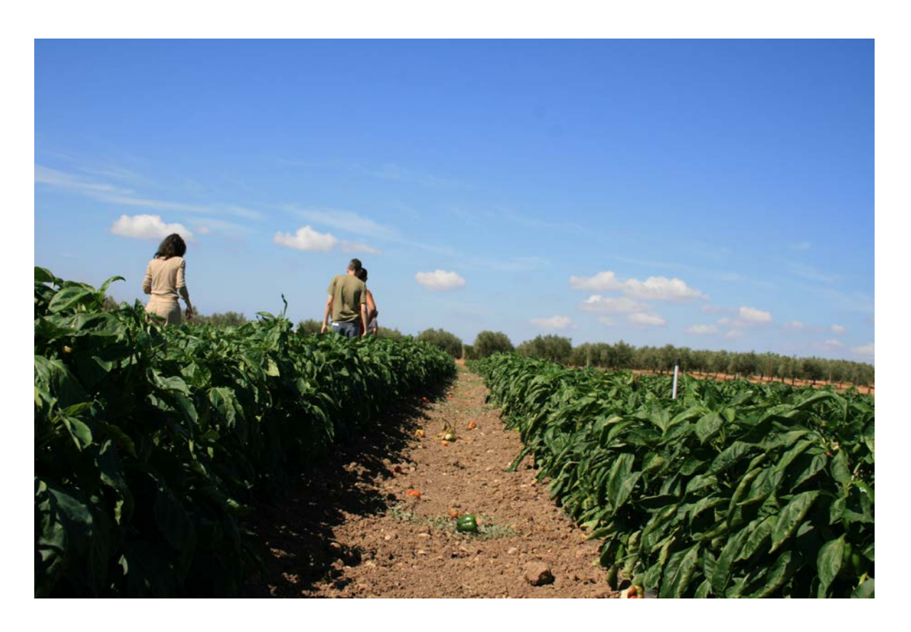
Figure 11: rows of green peppers on Francesco's farm, and olive trees in the background.

Given this state of affairs, it is hardly surprising that growers constantly tried to move closer to the more direct distribution chains in the organic system of provision, and away from those that involved numerous passages to reach the consumer market. In the final section I analyse the factors at the production and consumption levels constraining growers' desired agency.