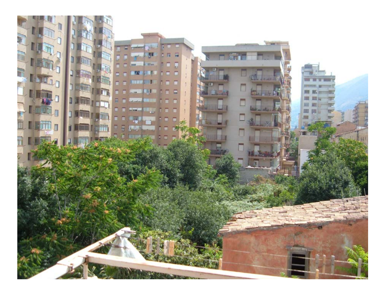
Figure 7: contemporary lower-middle-class dwellings, and the remnants of the city's outskirts.

The other reason for migrating towards the larger cities was to search for a job in the public sector, which was expanding rapidly due to the development of the welfare state. Accommodating the agricultural exodus from rural areas proved impossible for this sector as it had for the industrial one. The social pressure put on it, together with its (mis)management by the city's political parties of the time, gave rise to the city's capillary but infamously inefficient bureaucracy (see Crisantino 1990, especially chapter 5).