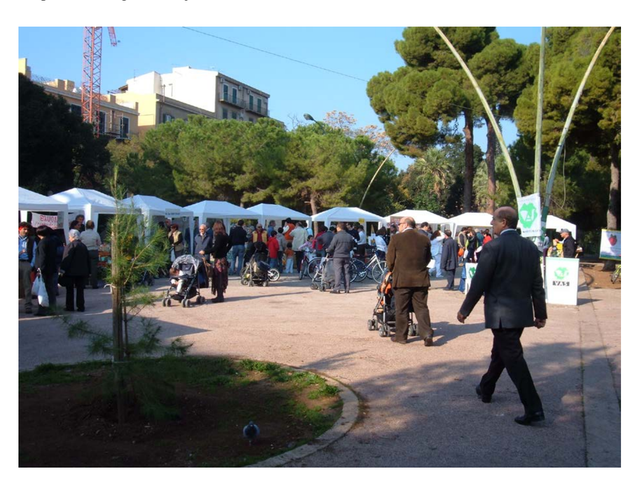
Picture 5: part of the organic farmer's market (source: the author).

The other coop that was present at the farmer's market was Equalis. This coop deals only in retailing, and thus owns only a shop, close to via Libertà , Palermo's most prestigious area. Its store is smaller than Equalis' (roughly 60m²), which reflects the enterprise's very young age. But it has two large shop-windows, and is more neatly divided in two similar sized rooms than the other store. Both sell a similar range of foods and goods, and are very similar in appearance. (In Palermo there are currently six other similar shops, excluding the two just mentioned.)