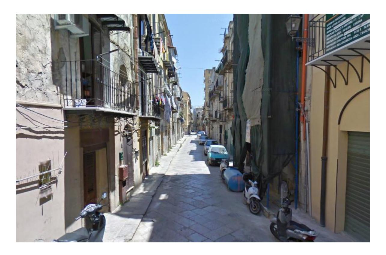
Figure 1: via Albergheria , where my flat was located. During the rainy days of winter, the street became covered with pools of water.

Phoenicians along a river that now runs underground—is only a ten minute walk from where I had to catch the bus.