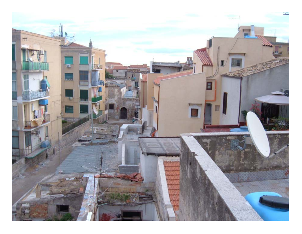
Figure 3: past, present, and future in the landscape of Palermo's historic centre. The complex in the top-right part of the photograph is a typical example of current renovations.

I walked further on and reached one of the remaining sections of the ancient city walls. This incorporates the stone pipes that were used to distribute water by taking advantage of the ground's natural pressure. The wall's surface—with the broken pipes' now visible, blocked by centuries of sediment—looked almost like the fossilised remains of an ancient organism. Opposite this wall, across a small square, is the city specialist paediatric hospital. The square was, as usual, completely covered by illegally parked cars, a system managed by a few (illegal) parking attendants—posteggiatori—who will 'find' a space in return for a fee. The posteggiatori are a perfect example of Palermo's vast informal economy.