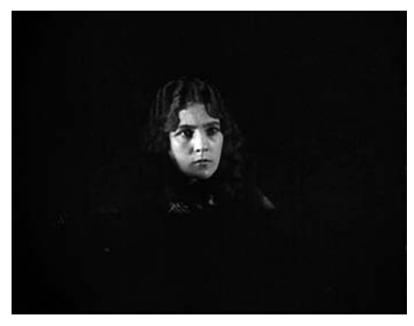
Figure 1c. Hypnotic circuit.