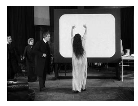
Figure 1a. Phone book.