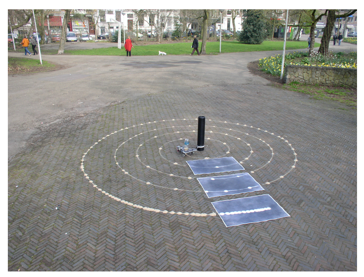
Figure 4 Spiral drawing sunrise: the finished work'; Esther Polak (2009)