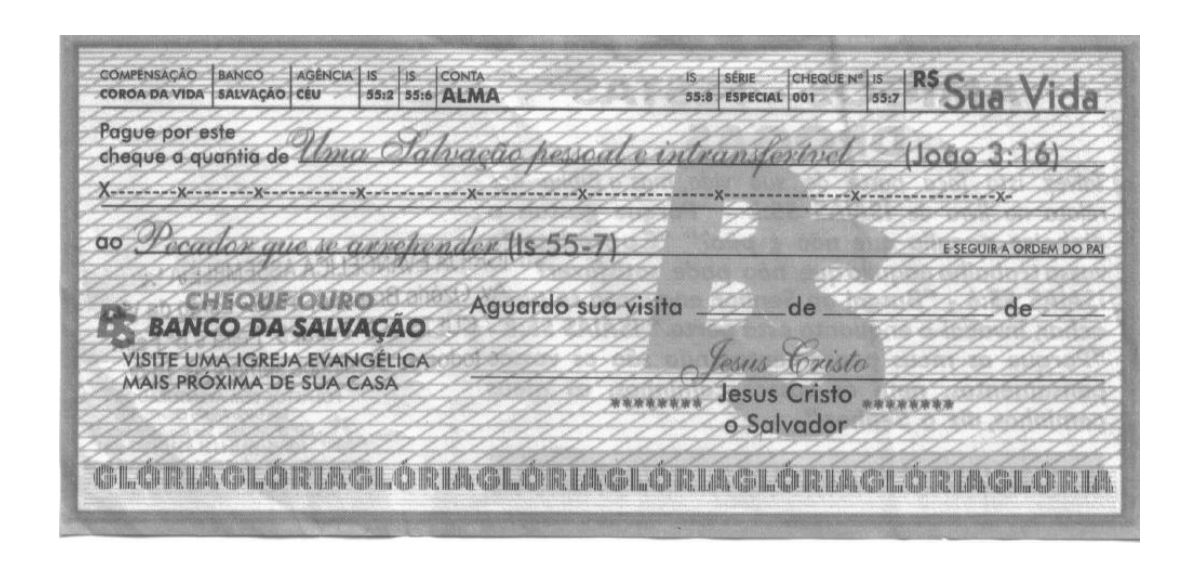
Figure 1 : Cheque Ouro, Banco da Salvação.

One day I was on the bus in Bahia, paying my ticket to the cobrador , the ticket collector. I gave him the exact change, to hurry up. He gave me back a piece of paper that looked like a check. The "check" belonged to the "Salvation Bank". The amount was "Your Life", "A personal and non-transferable salvation", assigned to the "sinner who would ask forgiveness". I could cash it in the "evangelical church closer to home".