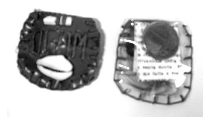
Figure 2. Patuás ( Amulets ) of Nosso Senhor do Bonfim . The one to the left makes reference to the Orixá Ogum; the cowrie shell was once a currency in Africa, but the historical memory of this fact has been lost in Brazil. The one to the right contains a Catholic prayer to Bonfim, and one cent.

(Figure 2). The use of these patuás obeys to the same logic: in the same terms that a coin can embody a dead spirit, it can also protect you from it- it can help you "close your body" ("fechar of corpo").